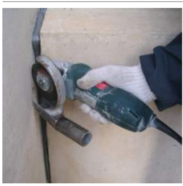
FIGURE 3.2 Removal of Concrete Adjacent to Former Seam of PCB Caulking Laid Between Pre-formed Concrete Panels

This situation is illustrated by a building in which concrete that was adjacent to beads of PCB-containing caulk was found to contain unauthorized PCB levels. Concrete in the immediate vicinity of the caulk was identified as PCB Remediation Waste and designated for removal and disposal. At this building, a ½-inch by ½-inch linear section of concrete was removed from both sides of every seam between concrete panels that formed the façade of the 17-story structure. The concrete sections were removed with hand-held circular grinding tools operated by trained laborers (see Figure 3.2). Approximately 18 miles of ¼ square inch concrete sections were removed from the face of the building. A hand-held HEPA vacuum was used to capture dust generated by the cutting tools. Personal protective equipment including