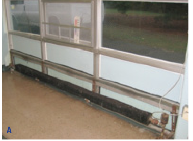
FIGURE 3.4 Panel A – Photograph of Pre-installment of Mini-walls/Panel B – Photograph of Post-installment of Mini-walls

An example of a false wall or "mini-wall" is depicted in Figure 3.4. At the time this building was constructed, PCB caulk was used to seal the joint between the aluminum framing and composite