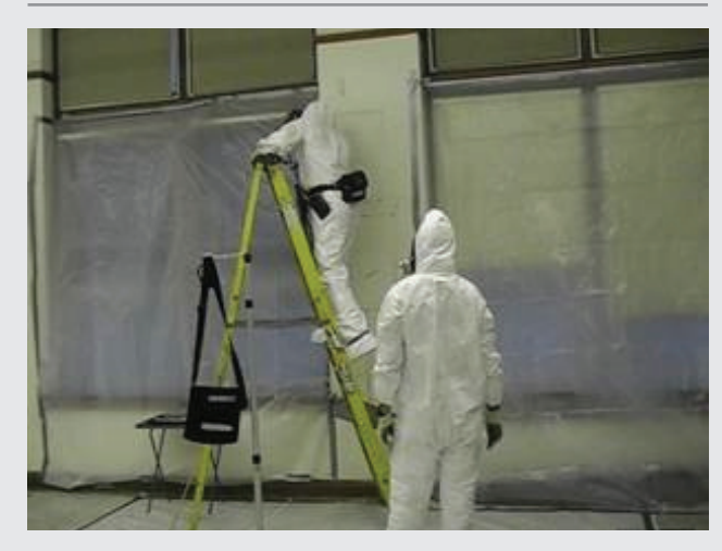
FIGURE 3.1 Photograph of PCB-Containing Caulk Removal Using Hand Tools

Direct bulk removal for PCB-containing paint can include the complete removal of all wallboard that has been painted. For cases where the paint cannot be removed without damaging the structural stability of the external wall, a "false wall" can be constructed over these painted external walls to prevent any direct contact with the existing