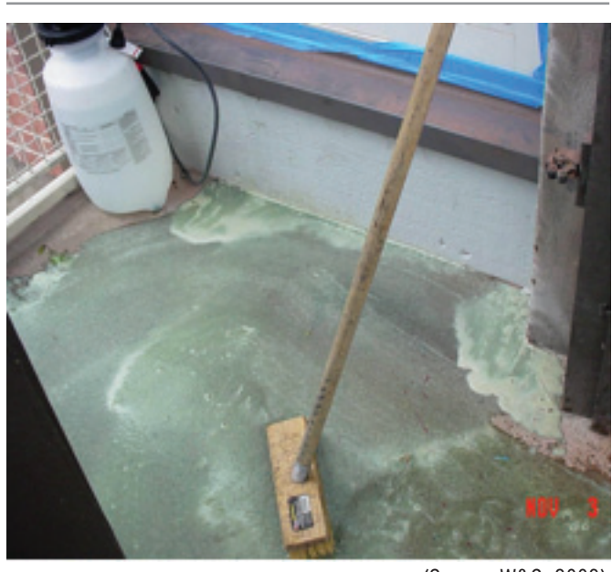
FIGURE 3.3 CAPSUR® application on PCB-Contaminated concrete surface

(Title 40 Code of Federal Regulations CFR Section 761.30(p)), which is required to prepare PCB-contaminated concrete for encapsulation. The surface washing steps used for this remediation included a detergent wash (1:3 ratio of water and Z-Green, ZEP Chemical Company), a potable water rinse, a terpene hydrocarbon solvent wash (Big Orange Industrial Degreaser Solvent, ZEP Chemical Company), and a solvent rinse. The detergent washing resulted in a cleaner surface and resulted in generally lower PCB concentrations on the concrete surface, while PCB levels remained the same or slightly higher during the solvent wash and rinse steps. The floors were subsequently scrubbed with a 30% muriatic acid solution