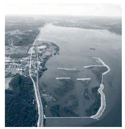
Pool 8 Island Complex 99 Aerial

nities for stewardship is the District's channel maintenance program, which includes comprehensive long-range planning with the active involvement of partnering agencies. Since the early 1970s, changes in channel maintenance have resulted in a 50 percent reduction in annual dredging requirements. These changes include closer monitoring of channel conditions, reduced dredging dimensions, and adjustments to channel control structures. In addition. the District places 95 percent of the sandy material dredged where it can be used for environmental enhancement, recreational use, land development, construction, or road maintenance.