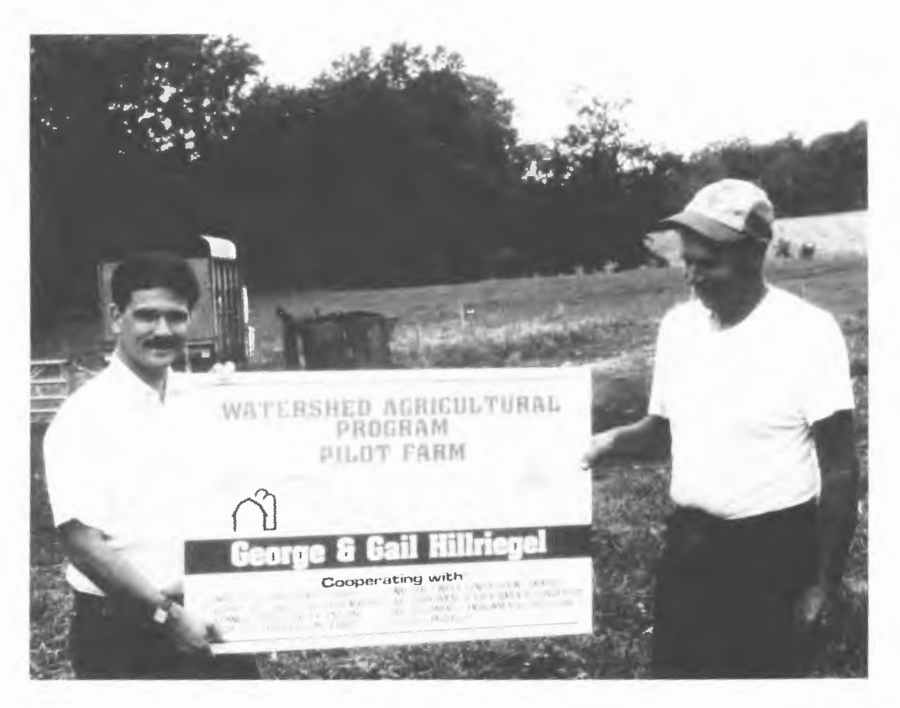
Watershed Agricultural Program Pilot Farm

An agreement was reached where EPA is expected to extend the city's filtration waiver to December 1999. In return, the city will take several actions including upgrading wastewater treatment facilities and instituting rules and regulations in the watershed. The city will also acquire land and support upstate/downstate partnership programs (water quality investment, economic development fund, and a regional watershed partnership council). The communities upstate will have the opportunity to sell property if they so choose. In addition, they will participate in the regional watershed partnership council which will also be composed of state, city, and downstate consumers.