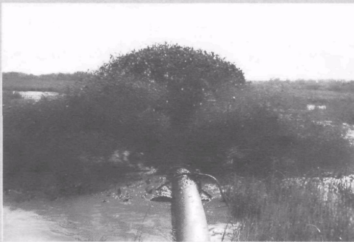
The discharge from the hydraulic dredge pumps a slurry of bottom sediments onto the face of the marsh.

overwash or rising ground water which leads to standing water which also will kill marsh vegetation. This combination of loss of sediment and standing water leads to marsh compaction and loss of wetlands. Studies have shown that there is a direct correlation between the existence of canals, dredged material levee density, and land loss. Local erosion is often isolated around the levees or within areas partially or wholly impounded by them. For this reason, the Barataria-Terrebonne National Estuary Program believes that it is important to promote alternative techniques that will