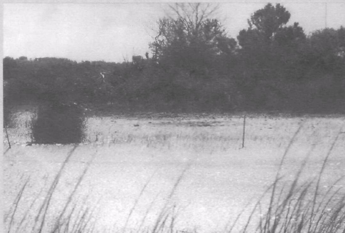
A year after dredging, new marsh growth is evident.

Although the project was designed to do a cost comparison of hydraulic vs. bucket dredging, it also provided the opportunity to study and determine if the environmental benefits of utilizing the bucket dredge method outweigh the additional costs. Monitoring of sites was conducted in June and October of 1996, and the sites were visited in January and March of 1997. A preliminary analysis of a small portion of the data collected at three ponds in Leeville, LA provided an indication of the amount of material accumulated and the levels of subsidence occurring. This admittedly preliminary analysis suggested that the deposited material did compact as expected. The material enhanced the sites and created new marsh in areas that were formerly covered by water. Existing vegetation appears to be thriving, and sprouting vegetation is visible throughout.