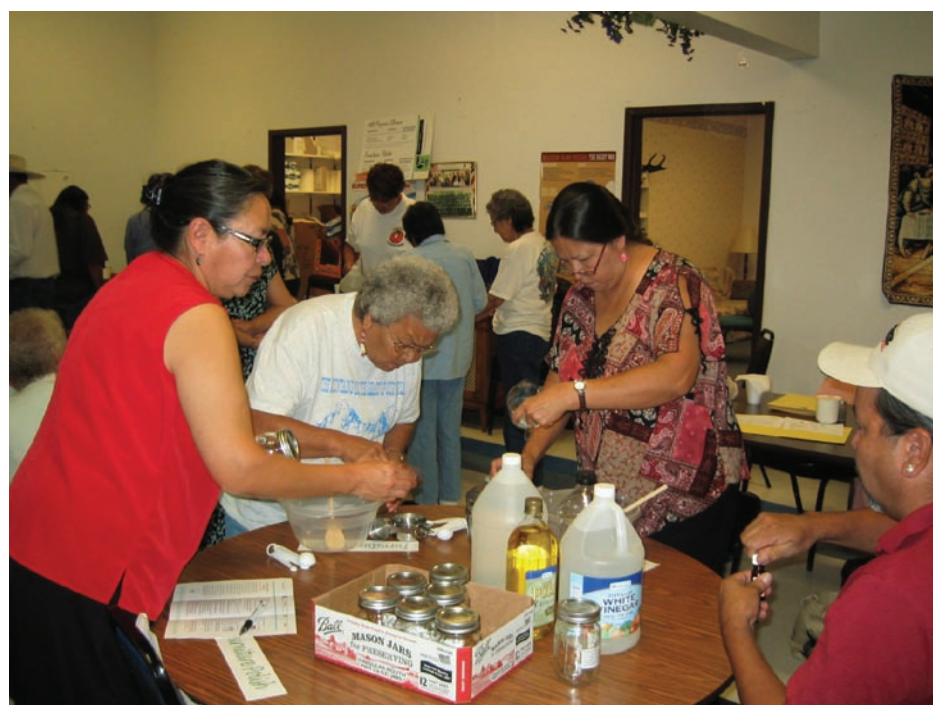
CARE project residents learning about green cleaners

Because CARE focuses on community-based identification of environmental priorities to facilitate change, many organizations came together through MICCP because they shared a common interest in improving the health of their community and the environment.