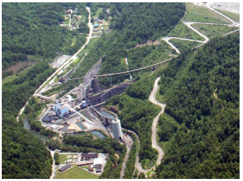
Coal sludge impoundment plant and nearby community, one CARE project focus area

Experts from regional universities shared test results and explained the water problems. Through this process, researchers gained the trust of individuals and citizens began to develop strategies for getting help. More knowledgeable and empowered, many of these same citizens