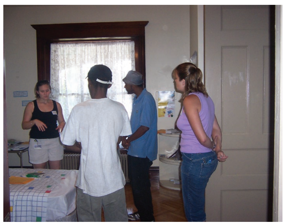
Residents learn how to reduce household environmental health risks

The Neighborhood Educator program was just one of the CARE grantee's six mini-projects. The program also worked in concert with the City of Rochester's Neighbors Building Neighborhoods program to address local environmental concerns.