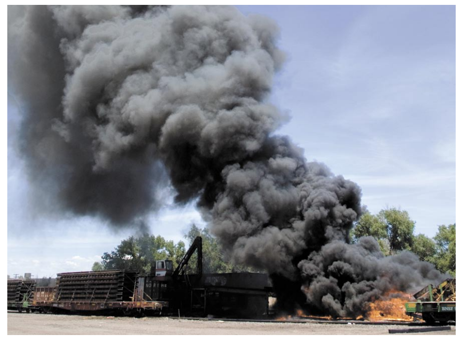
Railroad ties burning in Peppersauce Bottoms before CARE engaged with the community

In 2006, PuebloCARES responded to local flooding issues by providing labor and materials to clean up and rebuild flooded homes. PuebloCARES also used EPA Brownfields funding to assess the contamination of the largest lake in Pueblo and the area surrounding it. The assessment cleared the way for Pueblo to acquire and develop the property as a recreational area that will also help with flood control.