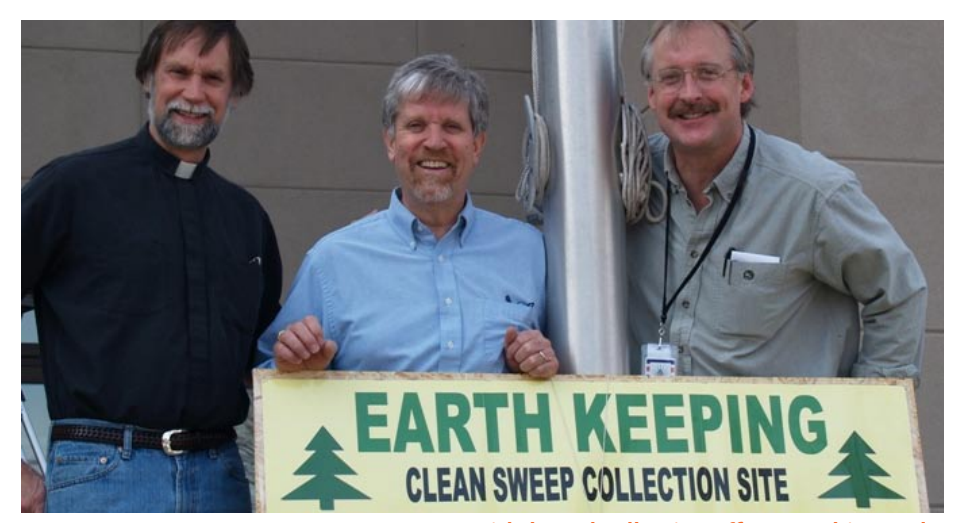
Faith-based collection efforts get big results

Then in 2007, the Earth Keepers Network expanded to include local pharmacists and law enforcement to facilitate the collection of unused pharmaceuticals and prevent improper disposal. Again, using church and temple parking lots, the collection effort collected, properly disposed of or provided for reuse of over one ton of pharmaceuticals. This responded to studies showing that pharmaceuticals are present in water bodies and may cause ecological harm.