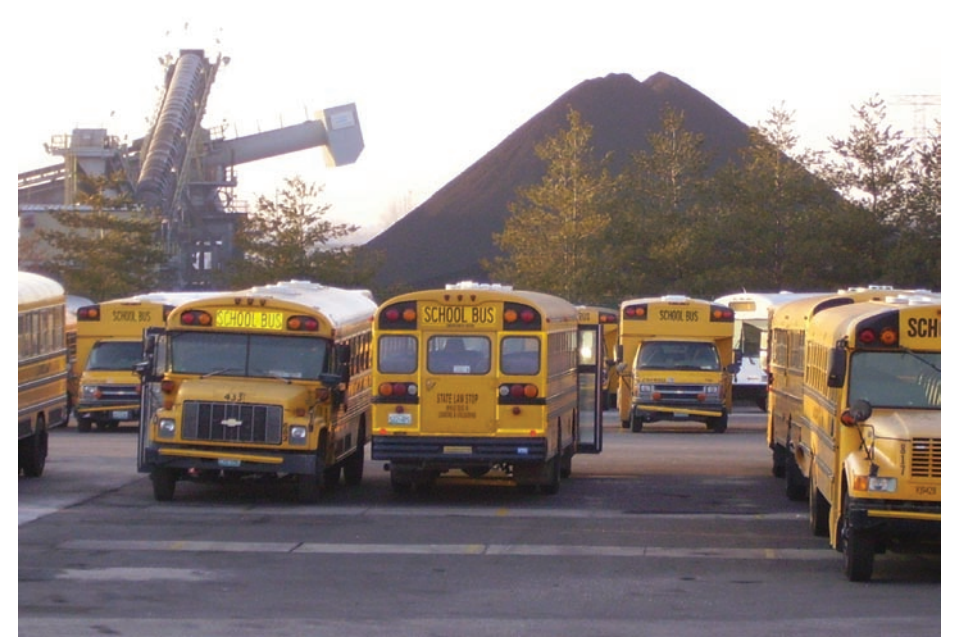
Efforts with local businesses included work with a local coal distributor to move coal piles away from school

To expand upon these successes, Grace Hill worked with local businesses, some of them significant contributors to pointsource emissions on pollution prevention strategies. A local coal distributor, located near a school, reduced its fugitive air emissions by 75 percent and agreed to contain the coal piles drifting into the school buses. St. Louis Covidien