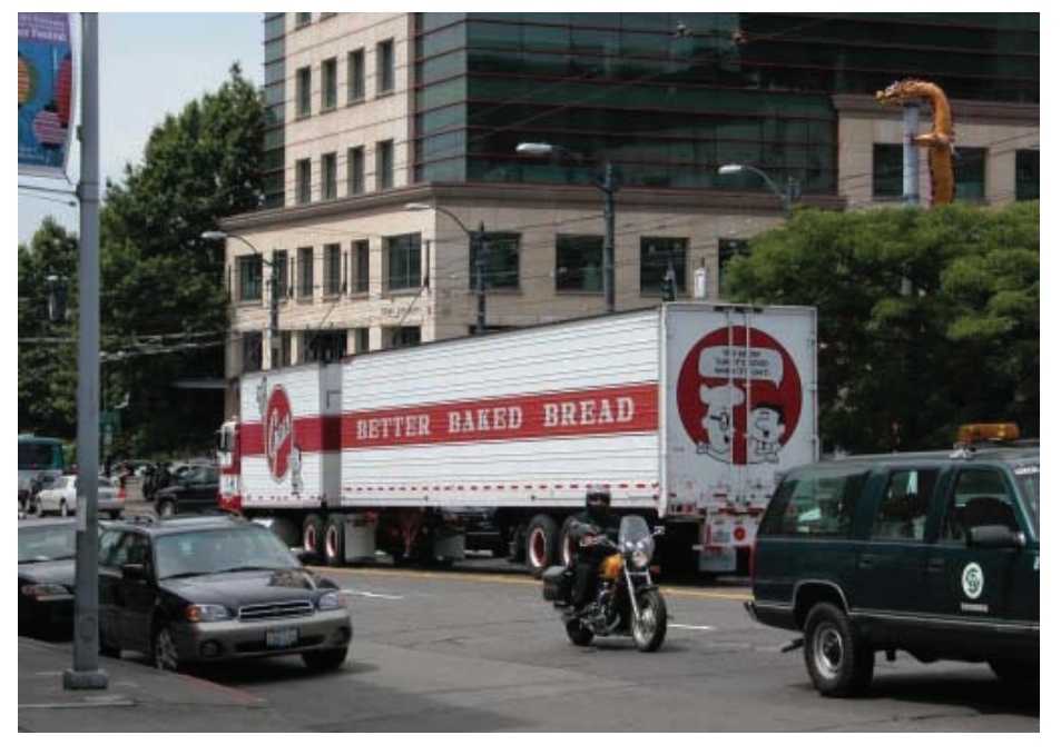
Diesel trucks drive through the international district's downtown

CARE work continues through the Community Advisory Board comprised of elders and the WILD's youth. Youth have become community leaders and a high percentage have sought and been accepted into college and local government internships. Finally, the intergenerational cooperation that took place during the project educated and engaged youth and elders about pressing problems in their community, and promoted a sense of community essential for tackling future environmental issues.