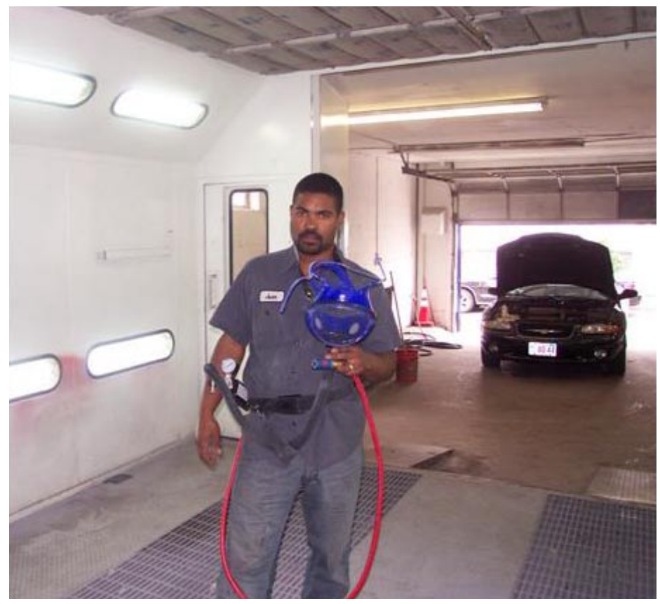
Instruction on Personal Protective Equipment (PPE) was provided to workers

The ability of the project to build trust and gain entry into auto shops and work in a highly collaborative fashion set the foundation for significant change in workplace practices. These practices include switching to aqueous brake cleaner, reducing perchloroethylenecontaining aerosols, using hydrophic mop technology, oil and solvent recycling, waterborne coatings to eliminate volatile organic compounds (VOCs) as well as labeling waste containers, oil, anti-freeze, paints and solvents and improving sanitary conditions. Moreover, the project will be sustainable beyond the EPA grant period and replicated in other sectors.