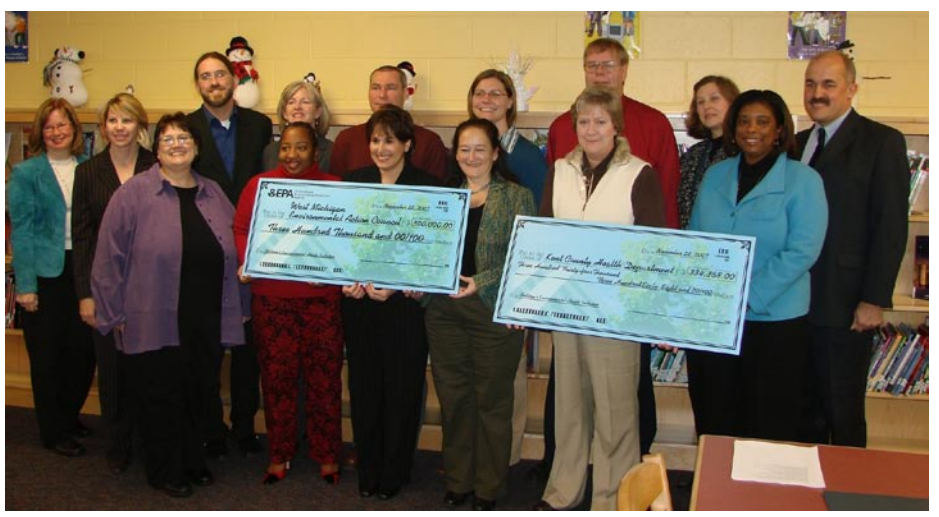
EPA and CDC together invest in children's environmental health

Follow-up with direct services and Family-Centered Action Plans. ClearCorps /Healthy Homes Coalition and Kent County Health Department now provide direct services for the comprehensive set of issues including lead hazard reduction, integrated pest management, provision of smoke and carbon monoxide detectors, and other services.