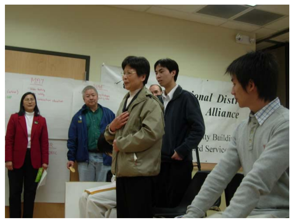
Elders and youth meet to identify local risks

A massive outreach campaign was launched by youth and elders to