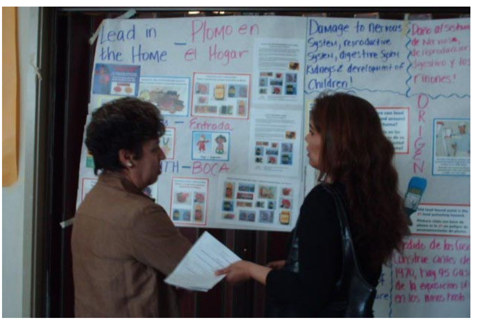
Residents meet at a public forum to share information on local health issues

Once the community was educated about their various environmental concerns, the collaboration convened a meeting where small groups of citizens discussed the pollutants of greatest concern, based on their known risks. Each group was composed of four or five members of the partnership and one EPA or county leader. Then, through facilitated consensus they were able to rank the risks from more risky to less risky.