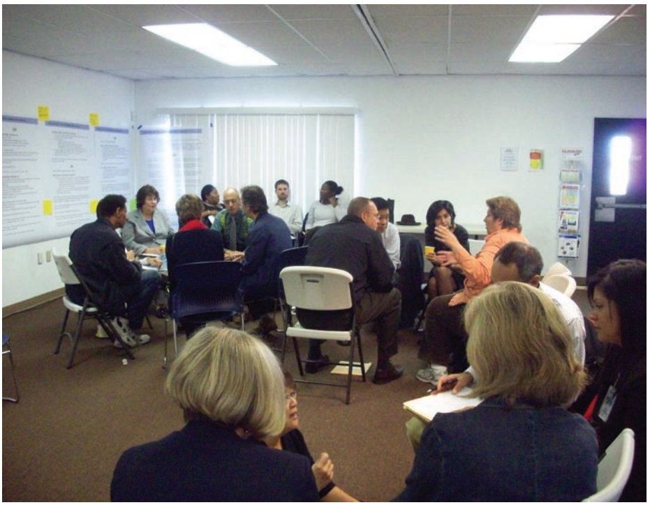
Workgroup members meet to tackle issues and are guided by the partnering agreement

The collaborative was orchestrated so that all key sectors are effectively represented and heard.