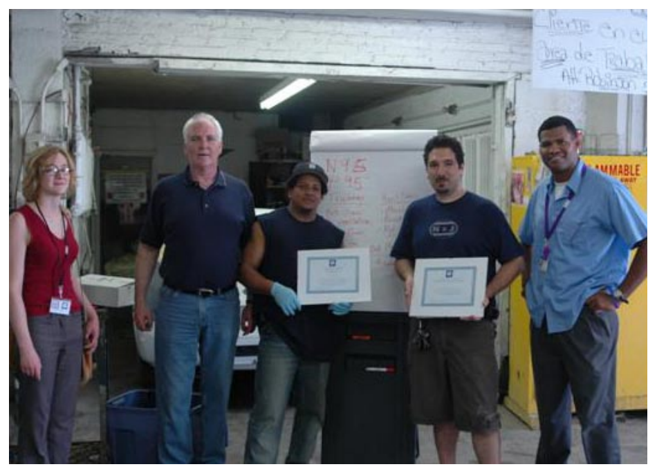
Boston Public Health's Safe Shop Training completed at a local shop