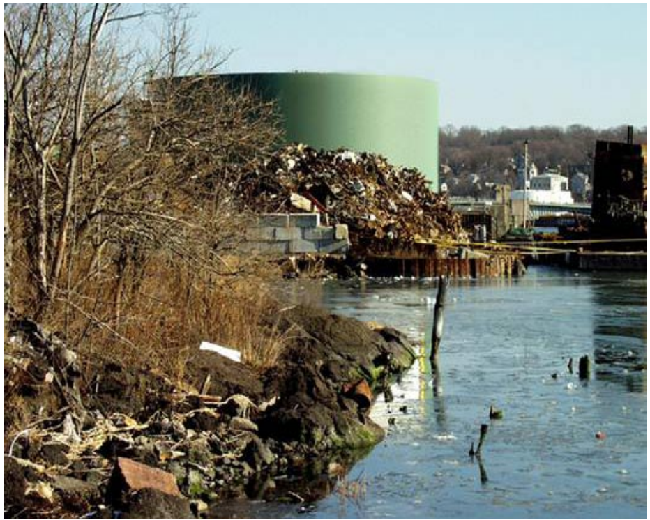
This brownfields/river site was cleaned up and will be redeveloped