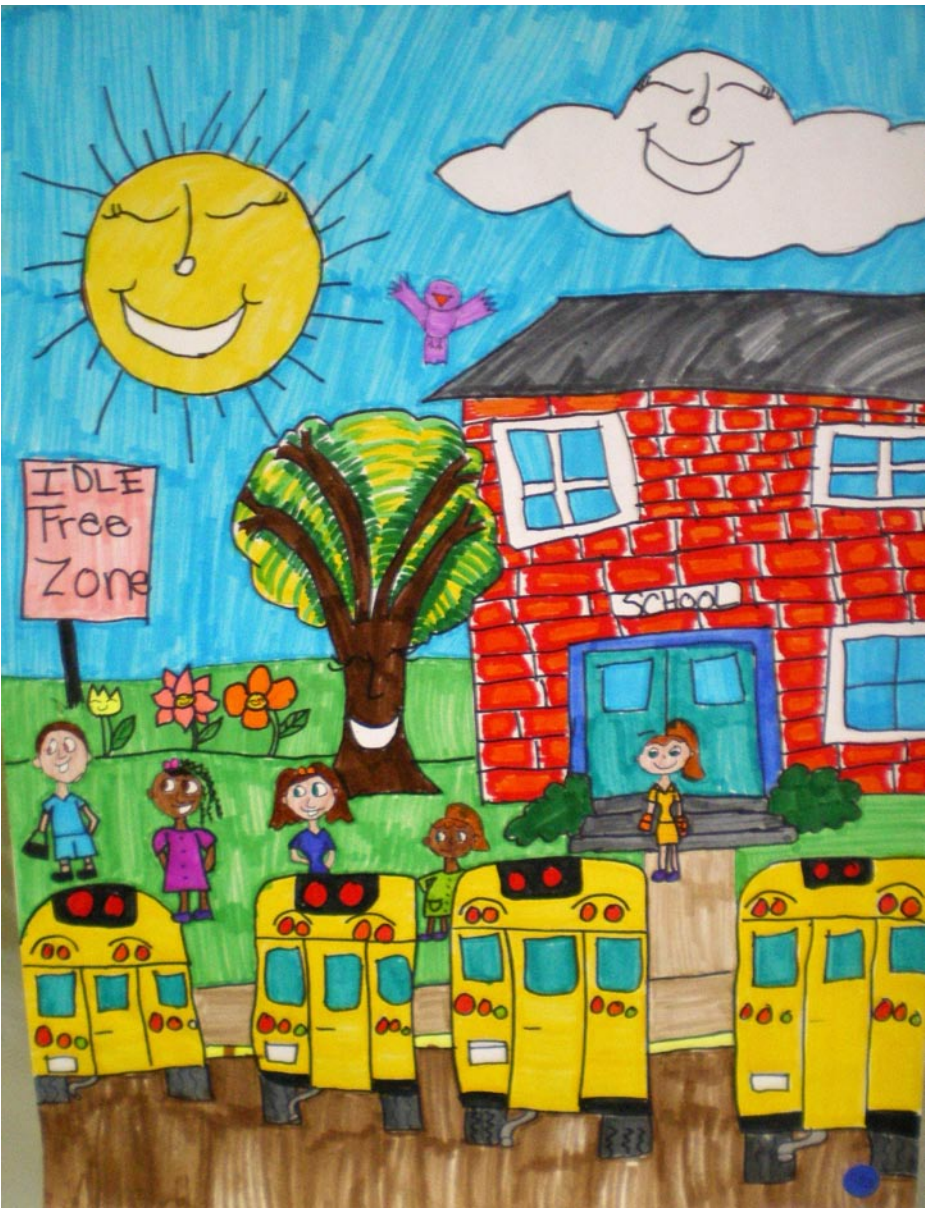
Anti-Idling poster contest

Experience gained from the CARE project allowed the grantee to secure an additional $3 million dollars for diesel engine retrofits (including 520 school buses, 91 airport support vehicles, 50 fire department trucks, 33 refuge haulers, 35 commercial trucks, and a tugboat). An additional 929.8 tons of emissions and 98,430 gallons of fuel will be saved annually.