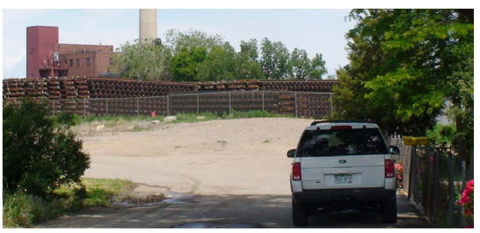
Creosote-treated railroad ties stored in the neighborhood prior to CARE engagement

Each of these efforts brought new partners to the table. In acting on each of these issues, residents began to develop confidence in their ability to cause change. This sense of community contributed to a robust engagement in the process of identifying and ranking the environmental issues of greatest risk and importance for the residents of Pueblo. A bias for action can help neighbors come together to better serve the entire community.