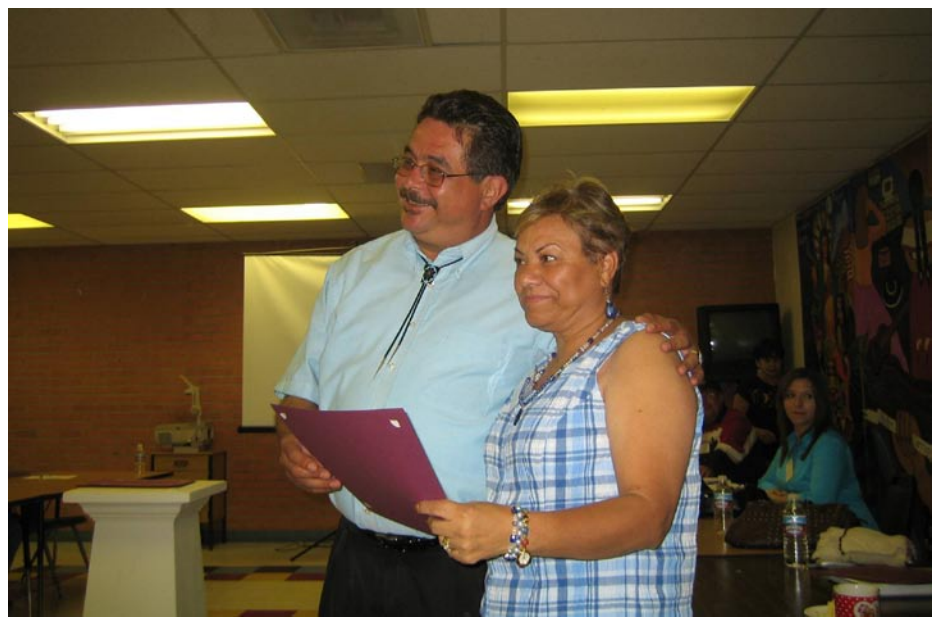
County Supervisor distributing certificates of training completion to promotoras

Finally, the project has developed a broad-based partnership with 23 members from educational institutes, businesses, and local and state agencies. $734,000 in additional funding was leveraged from EPA's Pollution Prevention program, EPA's Indoor Air program, the Department of Housing and Urban Development (HUD) and the City of Tucson.