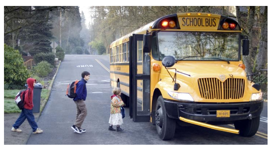
Children's health was used as a focal point for this CARE project

The program has been extremely successful. $435,000 in additional funding has been leveraged from CDC, an EPA vulnerable populations lead grant, and FEMA.