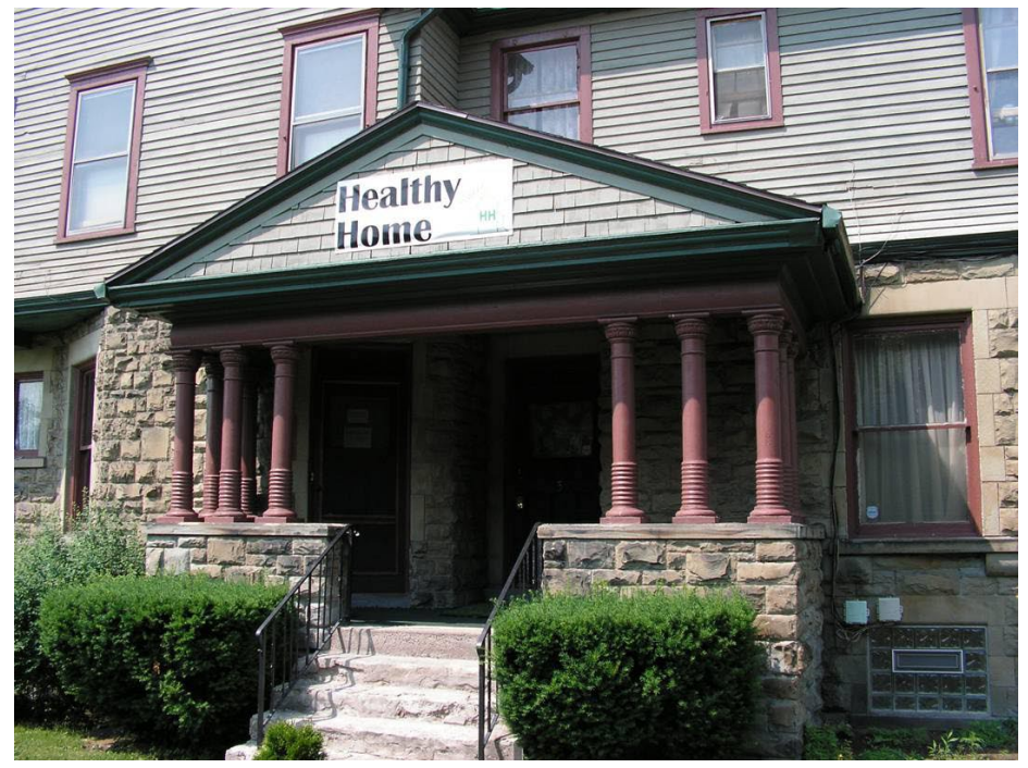
Rochester's Healthy Home Learning Center

Through this mechanism, the educator reached approximately 2,000 residents with environmental health information.