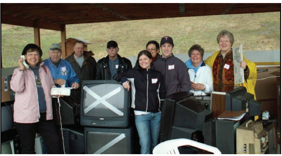
Over 320 tons of e-waste were collected by this CARE project

Success of this program caught the attention of the Michigan Dental Association, which then recommended this as a best management practice for all their member dentists statewide. Subsequently, EPA's Office of