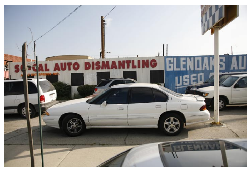
Seventeen auto dismantlers agreed to engage in environmentally sound practices

from local industries and potential next steps. Pacoima Beautiful's staff, health educators from the community and others then shared the results with businesses and obtained agreement on instituting more environmentally-friendly practices. Pacoima is continuing to expand outreach to additional businesses.