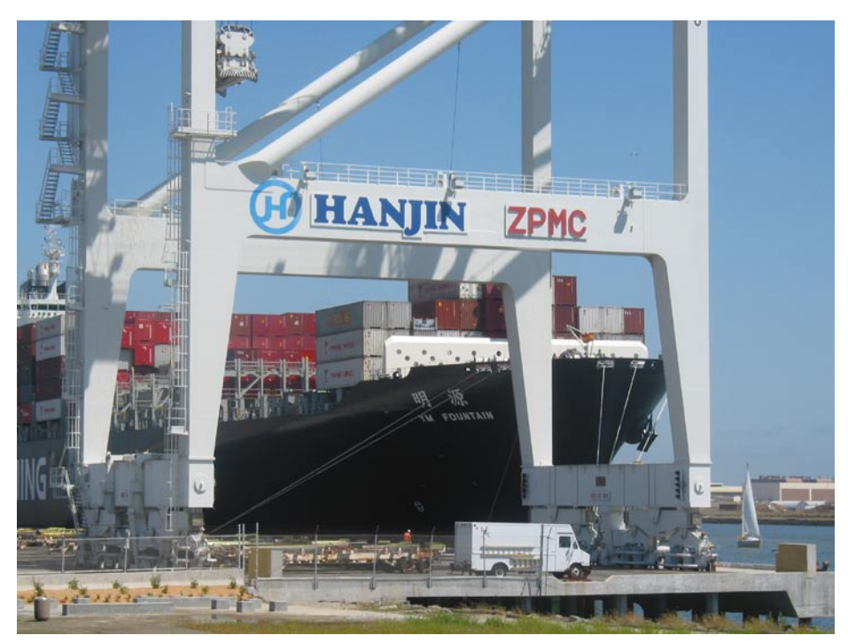
Reducing port-related diesel pollutants is a priority for the CARE collaborative

The success of this collaborative structure has served as a model for other agencies that foster community engagement and multi-stakeholder involvement. Project partners have observed that collaborations often work best when it is generally understood that other less collaborative options, such as lawsuits and political action, remain available "in the wings" if progress is not made during the collaborative process.