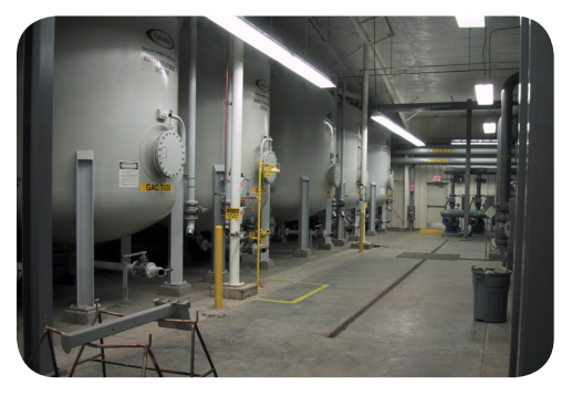
Indoor Treatment Facility