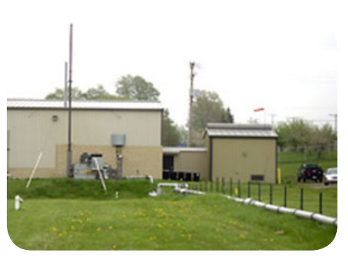
Groundwater Treatment Building