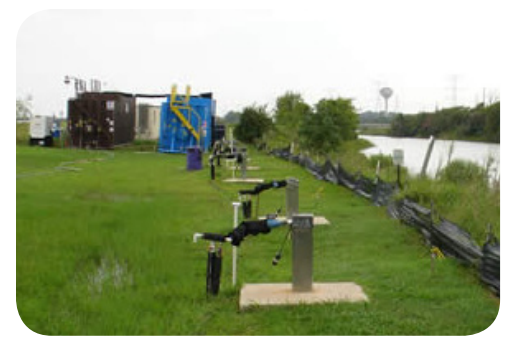
Groundwater Pumping Wells

Pump and treat is used to remove a wide range of contaminants that are dissolved in groundwater. Pump and treat typically is used once the source of groundwater contamination, such as leaking drums and contaminated soil, has been treated or removed from the site. It also is used to contain plumes so that they do not move offsite or toward lakes, streams, and water supplies. Pump and treat is the most common cleanup method for groundwater. It has been selected or is being used at over 800 Superfund sites across the country.