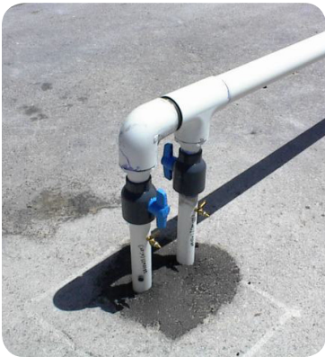
Pipes transport vapors from the underground SVE extraction well to treatment.

SVE and air sparging are efficient ways to remove VOCs above and below the water table. Both methods can help clean up contamination under buildings, and cause little disruption to nearby activities when in full operation. SVE and air sparging are often used together. SVE and air sparging are being used or have been selected for use at approximately 285 and 80 Superfund sites, respectively.