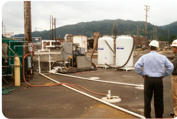
Above-ground treatment system includes two tanks of activated carbon.