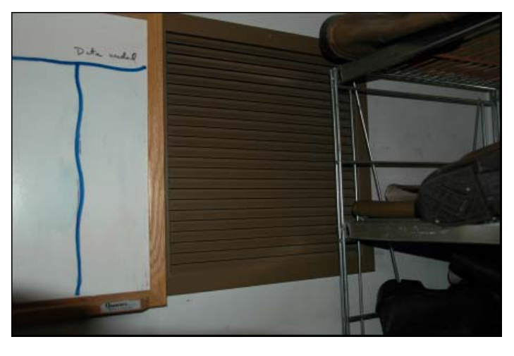
Figure 8 Equipment Room Vent (inside equipment room 41 µg/m<sup>2</sup> PCBs)