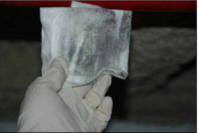
Figure 10 Sprinkler Pipe Parking Level 1 (60 µg/m<sup>2</sup> PCBs*)