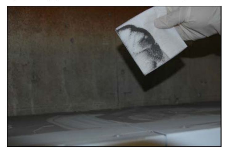
Figure 5 Equipment Room Locker Top Wipe Sample (11 µg PCBs)