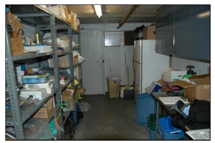
Figure 1 Equipment Room (facing entrance leading into parking garage)