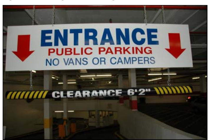
Figure 13 Parking Entrance Height Limit Bar