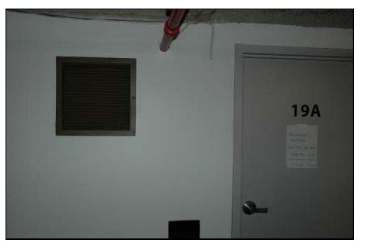
Figure 7 Equipment Room Vent (outside equipment room 133 µg/m<sup>2</sup> PCBs)