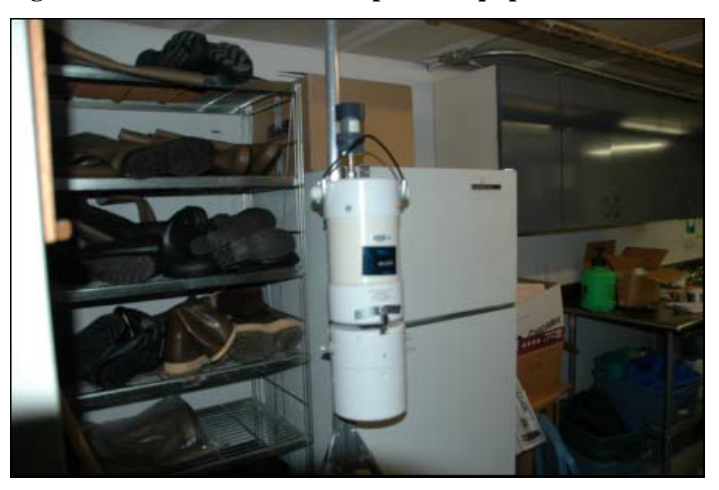
Figure 16 Mini-volumetric Sampler in Equipment Room