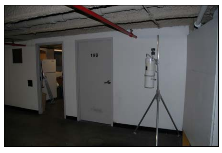
Figure 17 Mini-volumetric Sampler in the Garage Area