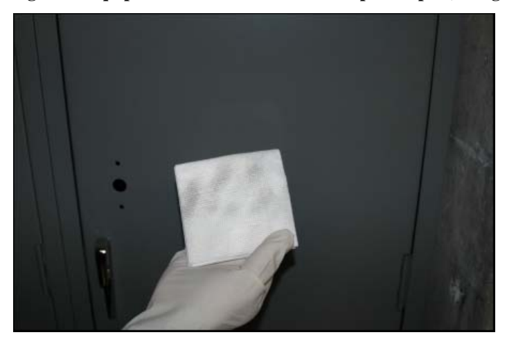
Figure 6 Equipment Room Locker Door Wipe Sample (0.3 µg PCBs)