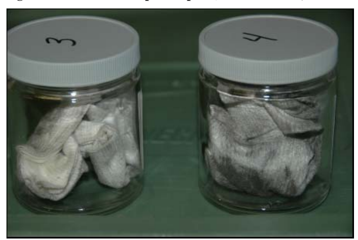
Figure 9 Vent Cover Wipe Samples (#3-inside room, #4-outside room)