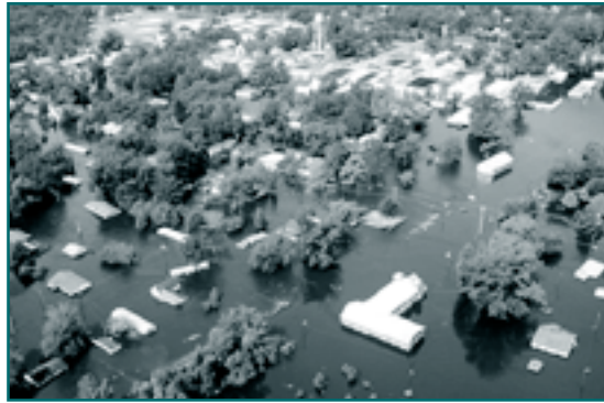
The Great Flood of 1993 in the upper Mississippi River Basin caused billions of dollars in property damage and resulted in 38 deaths. Historically, 20 million acres of wetlands in this area had been drained or filled, mostly for agricultural purposes. If the wetlands had been preserved rather than drained, much property damage and crop loss could have been avoided.

Biological productivity. Wetlands are some of the most biologically productive natural ecosystems in the world, comparable to tropical rain forests and coral reefs in their productivity and the diversity of species they support. Abundant vegetation and shallow water provide diverse habitats for fish and wildlife. Aquatic plant life flourishes in the nutrient-rich environment, and energy converted by the plants is passed up the food chain to fish, waterfowl, and other wildlife and to us as well. This function supports valuable commercial fish and shellfish industries.