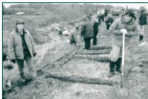
Through its Five-Star Restoration Program, EPA is working with multiple partners to reach a goal of 500 community-based wetland restoration projects across the nation.

If you want to restore a wetland on your property or in your community, many different organizations and agencies can help. Many land-owners are eligible to enroll in federal programs that provide restoration expertise and funding, such as the USDA's Conservation Reserve Program or the Fish and Wildlife Service's Partners for Fish and Wildlife Program. If your project doesn't qualify for such a program or it is a community project involving many different stakeholders, you might want to hire a professional to draft a plan and put together a team to do the work. You can obtain more information through the web sites and resources listed on the reverse.