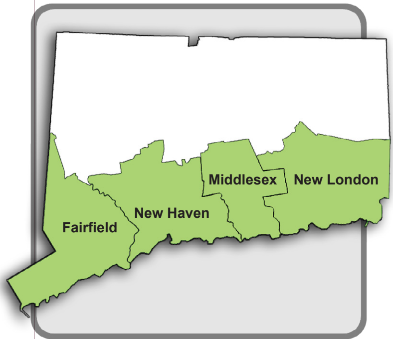
Table 1. Breakdown of monitored and unmonitored coastal beaches by county for 2008.