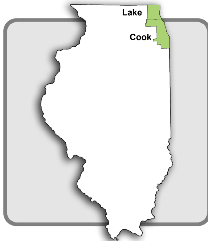
Table 1. Breakdown of monitored and unmonitored coastal beaches by county for 2008.