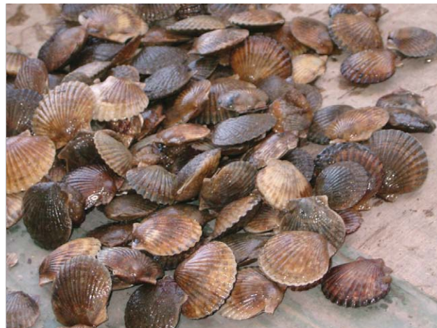
Figure 3. Bay scallops from a Peconic Bay shellfish nursery.