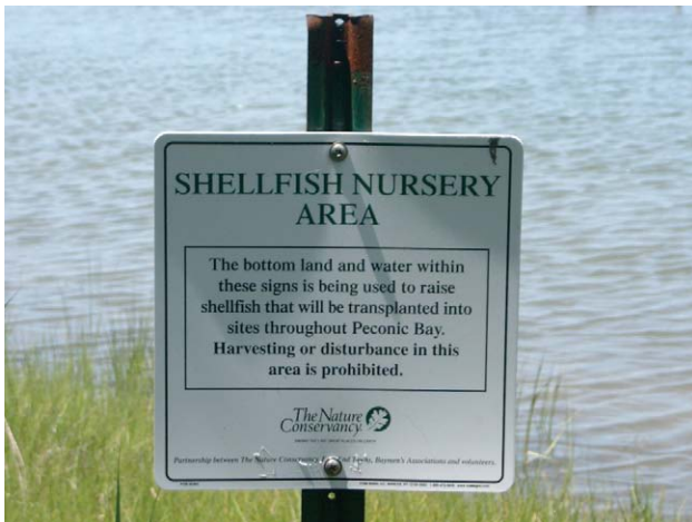
Figure 2. Public education sign informing readers about shellfish nursery area protection.