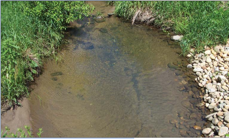
Figure 2. Excessive sedimentation is a contributing cause of degraded habitat in Eagleville Brook.