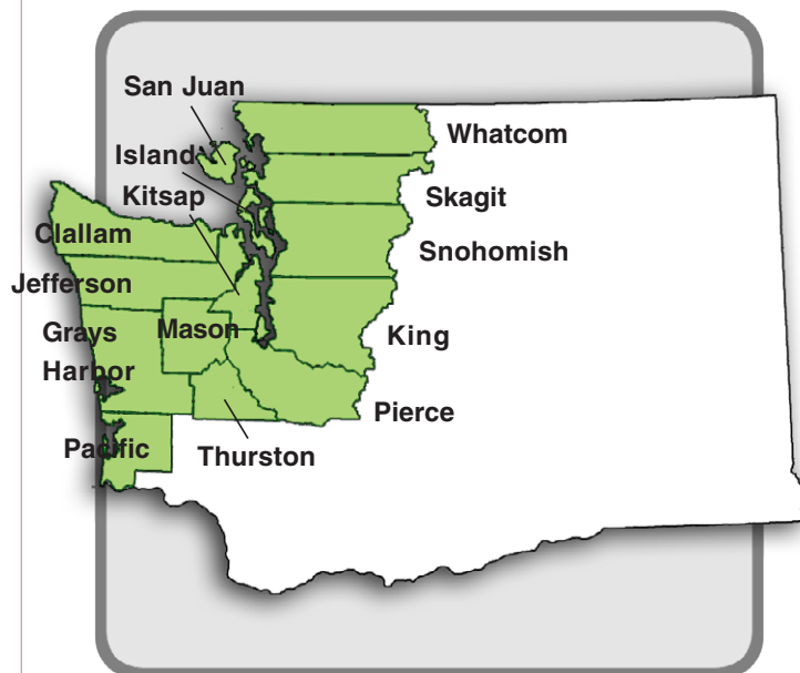
Table 1. Breakdown of monitored and unmonitored coastal beaches by county for 2008.