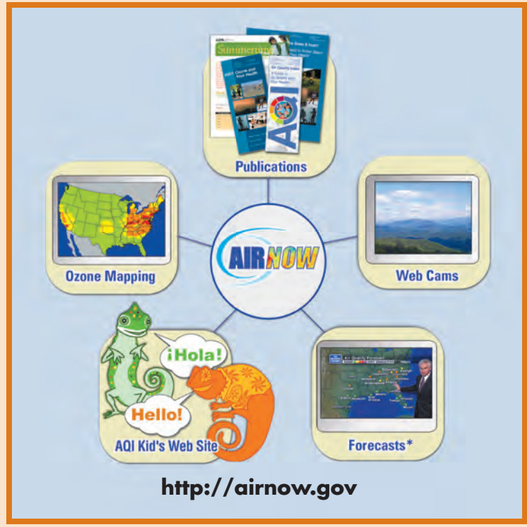
Daily air quality and health information are available on the AIRNOW Web site [ http://www.airnow.gov ]

The AQI is a national index, so the values and colors used to show local air quality and the levels of health concern will be the same everywhere you go in the United States. Look for the AQI to be reported in your local newspaper, on television and radio, on the Internet, and on local telephone hot lines.