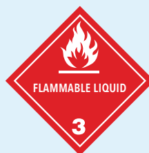
Ignitable Liquid Department of Transportation (DOT) warning label or placard