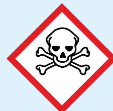
Toxic Substance Occupational Safety and Health Administration pictogram