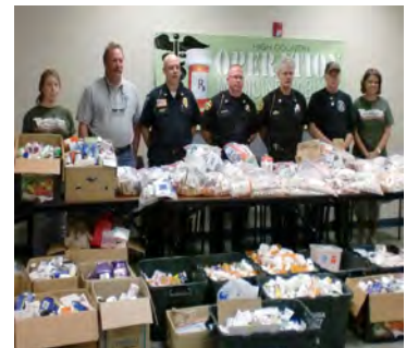
Drug Take-Back Event

To dispose of prescription and over-the-counter drugs, call your city or county government's household trash and recycling service and ask if a drug take-back program is available in your community. Some counties hold household hazardous waste collection days, where prescription and over-the-counter drugs are accepted at a central location for proper disposal.