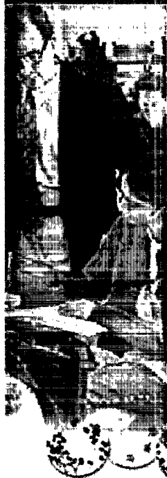
Mold Remediation in Schools and Commercial Buildings