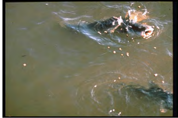
Channel Catfish feeding at the surface of the water.

Fish do not convert all of the applied feed to flesh. The difference between the input of a substance in feed and the amount of a substance in the harvested fish represents the amount of the substance that enters the pond ecosystem as uneaten feed and in fish feces and metabolites. Uneaten feed and feces are decomposed to metabolites, like carbon dioxide, ammonia, and phosphate, by pond bacteria. These substances are nutrients for the production of phytoplankton, and they also represent potential pollutants in pond effluent. Nutrient inputs and phytoplankton abundance increase as feeding rates increase. Mechanical aeration is used to maintain adequate levels of dissolved oxygen and encourage the oxidation of ammonia to nitrate by nitrifying bacteria. Deterioration of water quality from increased nutrient inputs stresses fish, and causes them to eat less, grow slowly,