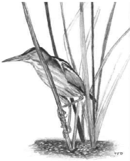
Least Bittern by Thomas J. Danielson

If three points per wetland are surveyed, approximately 100 easily accessible wetlands in a local area or small watershed can be visited three times in a typical field season. Only a fraction of this number of wetlands need be visited to initially develop and calibrate a regional IBI for a single wetland class.