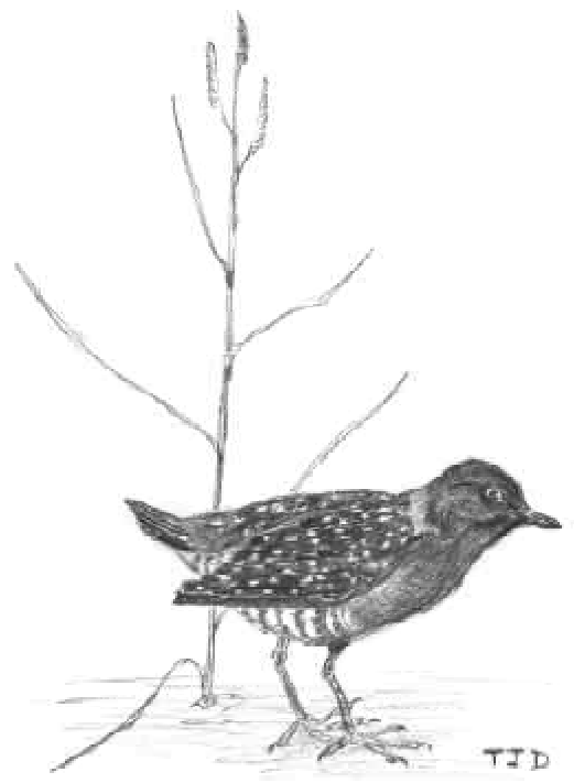
Black Rail by Thomas J. Danielson

When comparing sites (separate wetlands), data from the sites should represent equal effort. For example, it is inappropriate to make comparisons using seven survey points from a large site but only two survey points from a smaller site, or five visits to one site but only two to another during the same month. In such situations, compare the sites based on a single point or date chosen randomly from those at each site, or include a log of the area as a covariate in the statistical analysis. Alternatively, you might select from each wetland the point or date you found to have the highest counts of birds, or a point believed to be of exactly the same habitat type in all the surveyed sites. Such practices are not recom-