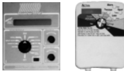
Figure 1. Two examples of ET controllers

A new generation of controllers, called ET based controllers, has recently become available that uses a measure of plants' water requirement called "Evapotranspiration" (ET). ET is used to schedule watering based on historical climate for a locale and is a measure of the rate of a plant's water requirement that involves plant transpiration and soil evaporation.