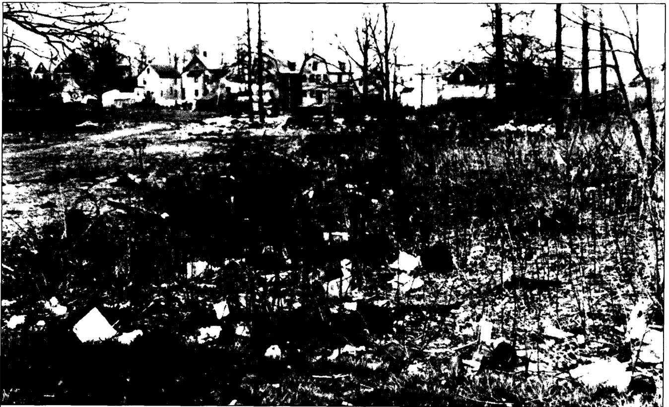
Virginia Avenue looking south toward Samuel Street, circa 1913. (Compare with photo on page 1.)

In May 1984, EPA and NJDEP jointly planned a pilot study to evaluate the feasibility of excavation and off-site disposal of the radium-contaminated soil. Twelve properties, with varying degrees of contamination, were selected for the pilot study, and preliminary engineering assessments were prepared. In the fall of 1984, EPA decided to forgo the pilot study since a full remedial investigation/feasibility study (RI/FS) had been initiated. NJDEP, however, decided to proceed with excavating the contaminated soil