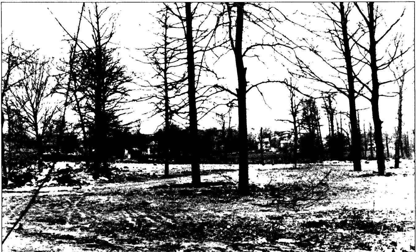
Virginia Avenue looking north toward Harrison Avenue, circa 1913. (Compare with photo on page 1.)

The decision to temporarily relocate families was made