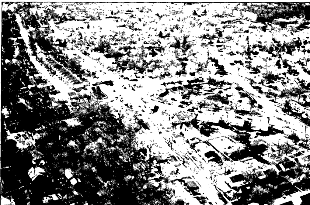
Urban development completely covers this once rural area. (Compare with photos on pages 3 and 5.)

how innovative technology, sound management, and effective community relations can work together for efficient, effective, and affordable environmental cleanup. To date, the Montclair/West Orange and Glen Ridge Radium sites are the largest residential cleanup in the country. With potentially responsible parties out of business for almost 70 years, very little work could have taken place without the Superfund program.