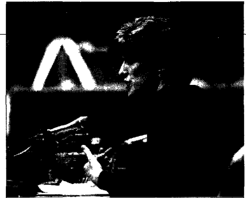
EPA Administrator-Designate Carol Browner testifies at her Senate confirmation hearing on January 11

I welcome this opportunity to begin a dialogue that I hope will set a new standard of cooperation and communication between Congress and the EPA...I also hope my tenure will mark a new era in communication between the EPA and