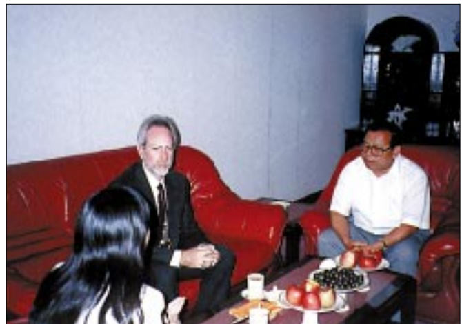
U.S. EPA's James Goodrich (back left) discussing demonstration technology activities with the mayor of Zibo City (right) and a technical expert (front).

nants. Many residents transported their drinking water from a less contaminated aquifer nearby which may be unable to sustain this additional drawdown. Solution: To ensure the safety of drinking water drawn from the local groundwater supply, a 10 gallons per minute treatment train was installed; treatment processes include tray aeration, multimedia filtration, granular activated carbon (GAC), and reverse osmosis. The system has been operating well since January 1997.