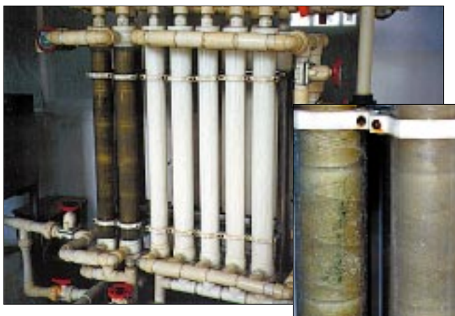
Use of locally manufactured materials presented an unexpected problem. Translucent plastic piping exposed to sunlight lead to heavy biofilm growth (green areas in two leftmost columns and inset) in a treatment system found in China.

Problems: Local drinking water supply contains unhealthy levels of natural and man-made contami-