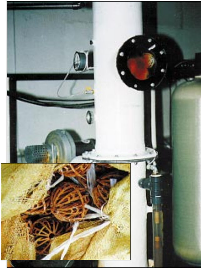
This component of the demonstration treatment technologies is an 'air stripper' used to remove volatile organics from the water. Its packing (visible in the porthole and inset photo), white when newly installed, has been fouled due to high iron concentrations.