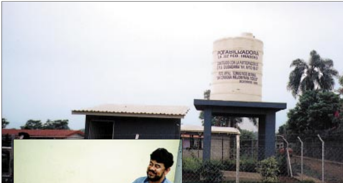
Treatment facility and storage unit installed at La Luz, Mexico demonstration site. Drinking water is provided to nearby elementary school and also made available to community residents.