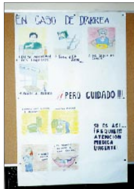
Poster used in a Mexican clinic to explain measures to take when stricken with diarrhea.

Demonstrations of drinking water treatment technologies in Mexico are being funded under an