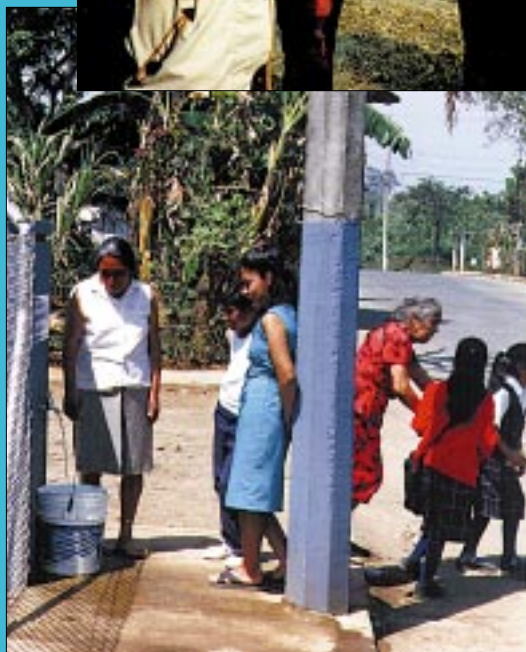
Providing Access to Treated Water in Mexico