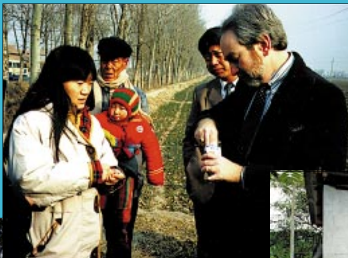
Testing Water in China