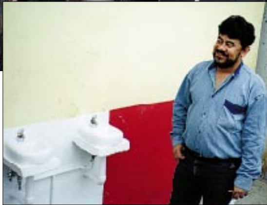
Professor at F.I. Madero School in La Luz. Newly installed fountains will help provide students access to treated water from the U.S. EPA demonstration facility at top of page.