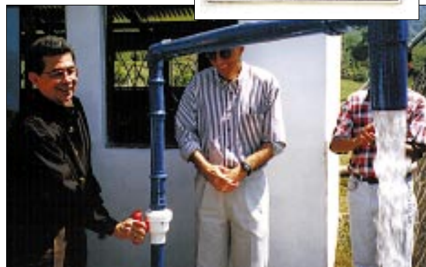
In the top photo, USDA representative (left) and Vera Cruz state governor (2nd from left) viewing treatment technology at the dedication ceremony in Ixhuacan. Plaque (inset) honors contributions by the U.S. EPA and USDA. At bottom, the governor officially opens operations at the Ixhuacan treatment facility.