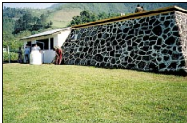
Drinking water treatment and storage facility at Ixhuacan, Mexico.

Solutions: Multimedia filters were installed followed by bag filters and a chlorination unit. The Vera Cruz state government has shown a great deal of interest in the drinking water treatment demonstration project at Ixhuacan. Improved drinking water quality is part of an overall plan to encourage residential and industrial growth in this part of Mexico.