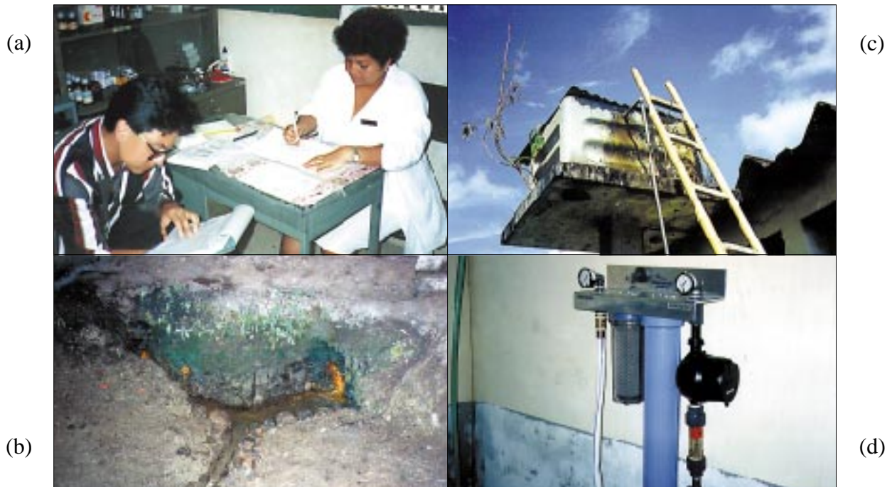
La America demonstration site. (a) Local clinic records are being reviewed for incidence of illness and death caused by diarrhea. (b) Drinking water source for LaAmerica. (c) Water storage tank for La America clinic. (d) One of the point-of-use treatment units installed in La America. Blue cannister contains an easily replaceable filtration cartridge.

during this period; a negative pressure inside the distribution lines is likely during off hours (see figure at top of previous page). Residents find a yellow slime on the bottom of their home storage tanks when the water is allowed to settle. Records from the local health clinic indicate that diarrhea is the most common disease; residents have suffered from such parasites as Entamoeba histolytica , Giardia , and Ascaris lumbricoides (worms).