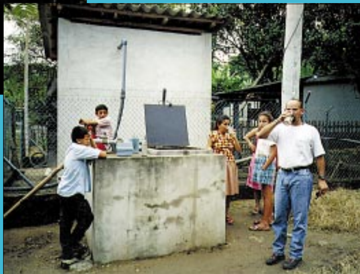
Drinking Disinfected Water in Ecuador