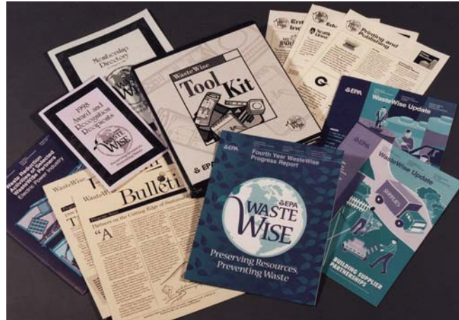
The information contained in WasteWise publications has been one of the most useful benefits of membership for many partners.

attention—construction and demolition (C&D) debris. By encouraging partners to reuse or recycle C&D debris, WasteWise enhanced partners' efforts to institute “green building” practices.