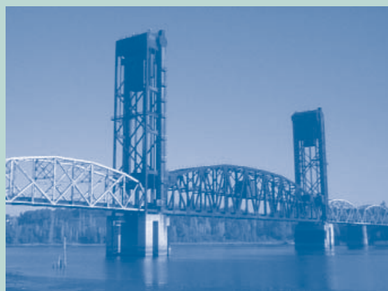
On track over the Willamette River near Eugene Oregon.

With permit renewal approaching and a newly listed endangered species in the receiving river, the EMS strengthened integration of the regional wastewater program's functional components to optimize environmental benefits. The focus moved beyond compliance with specific targets for more efficient use of natural resources and improved effluent quality. A new documentation system improved staff productivity and allowed tracking of 65 discrete activities that have significant environmental impacts. Significant staff time and $50,000 in development costs were needed to prioritize environmental impacts, create, and implement the EMS. Savings on electricity and paper use and waste disposal nearly recouped the costs within two years.