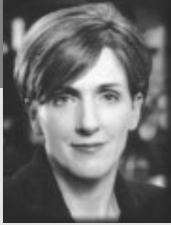
Carol M. Browner