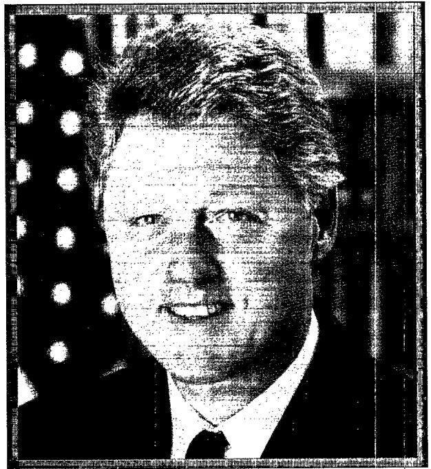
President Bill Clinton

"Preserving the environment is at the core of everything we have to do in our own country...As we renew our environment, we renew our national community."