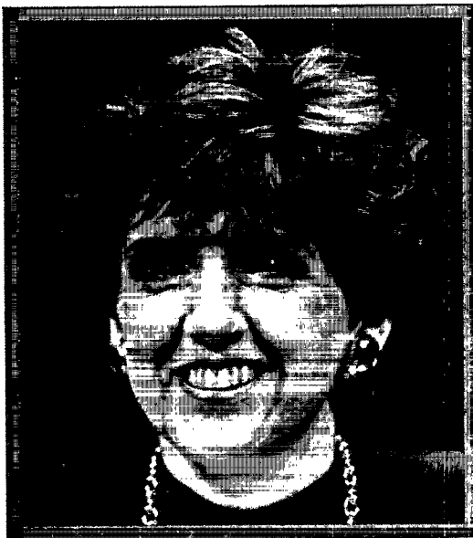
Carol M. Browner EPA Administrator

"Environmental protection begins with environmental education. Only by learning how we relate to our environment can we contribute to making and keeping the world around us a safer, cleaner place to live".