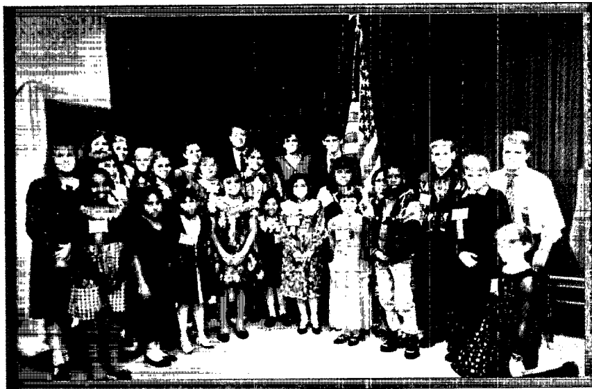
Additional participants of winning projects with EPA Administrator Browner and Vice President Gore