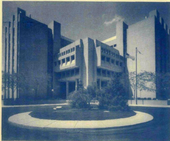
Andrew W. Breidenbach Environmental Research Center - Cincinnati