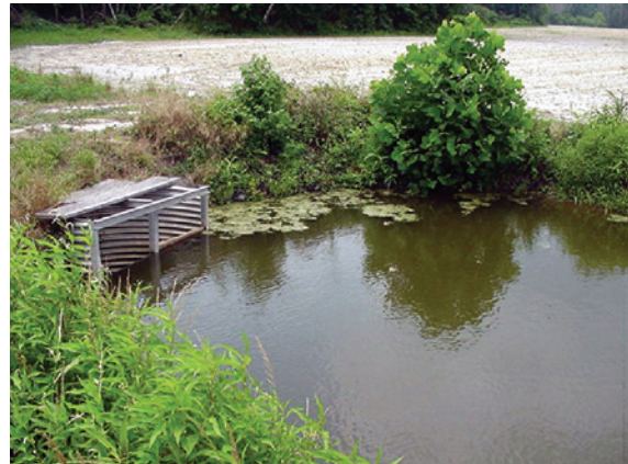
Area farmers installed water table control structures like the one shown here to address excess nutrients.

In response, the North Carolina Environmental Management Commission designated the Tar-Pamlico River Basin as "Nutrient Sensitive Waters" and called for a strategy to reduce nutrient inputs from around the basin. The strategy's first phase, which ran from 1990 through 1994, produced an innovative point source/nonpoint source trading program that allows point sources, such as wastewater treatment plants and industrial facilities, to achieve reductions in nutrient loading in more cost-effective ways. The group cap structure of the trading program has allowed the point source coalition to exceed its reduction targets