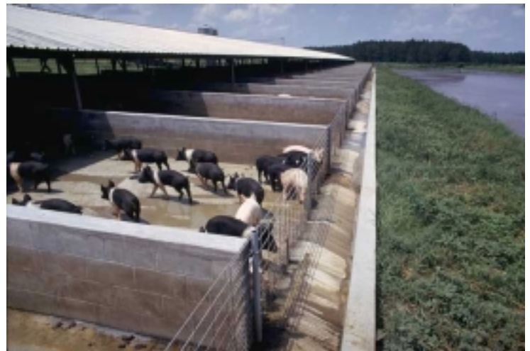
Hog parlor with lagoon

A lagoon should be constructed with a low-permeability liner made of synthetic material or geotextiles or formed by compacted clay or other soil material. Once the liner is established, it is imperative to maintain its integrity during the waste removal process. Any erosion can lead to seepage and subsequent contamination of ground water. Two practices to protect the liner are building a concrete access ramp for waste removal equipment, and operating equipment under dry conditions by first removing all the liquids and letting the solids dry.