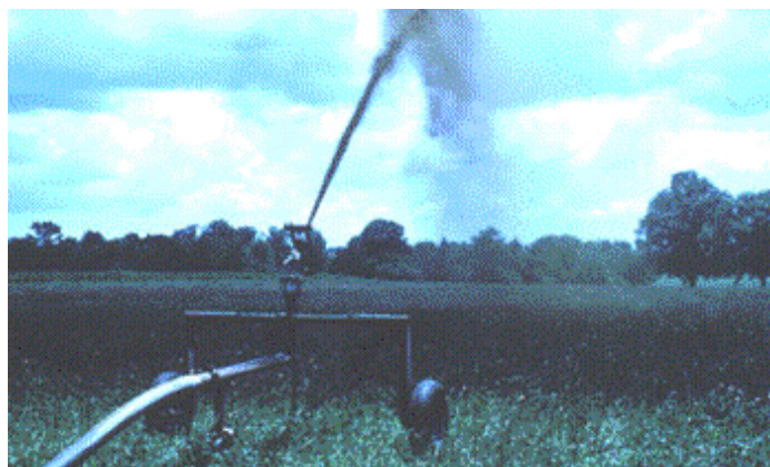
Animal waste used as fertilizer

Effective nutrient management minimizes the quantity of nutrients available for loss. This is achieved by developing a comprehensive nutrient management plan and using only the types and amounts of nutrients necessary to produce the crop, applying nutrients at the proper times and with appropriate methods, implementing additional farming practices to reduce nutrient losses, and following proper procedures for fertilizer storage and handling.