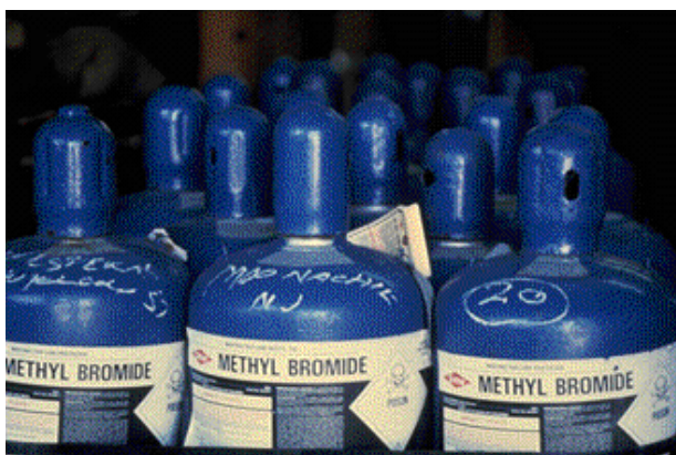
Pesticide storage tanks

Pesticide storage is key to preventing ground water contamination. If pesticides are stored in intact containers in a secure, properly constructed location, pesticide storage poses little danger to ground water. You must follow directions for storage on pesticide labels, although the