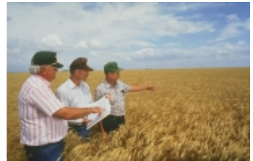
Corn - wheat - fallow rotation

Crop rotation reduces pesticide use by breaking up the pest cycle. As crops are rotated, pests such as insects and weeds cannot adapt to the changes in nutrient sources. Insects will move to another location where they can find food. Weeds will become dormant until the right condition returns. Crop rotation also increases crop yields and lowers irrigation and fertilizer cost. Pesticide rotation reduces the risk of pesticide-resistant pests. As pesticides are used year after year, pests develop immunities to them, resulting in increased application of pesticides.