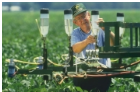
Ultra low-volume pesticides

Split application , with one-half to two-thirds of the pesticide applied prior to planting and one-half to one-third applied at planting, can reduce pesticide runoff by up to one-third. If good