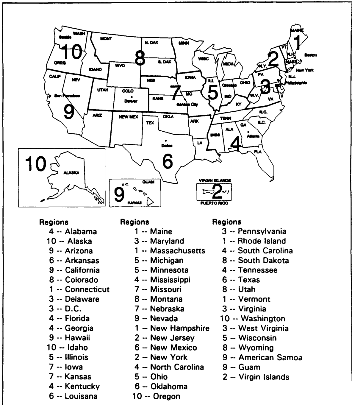
Figure I-1 EPA Regional Offices