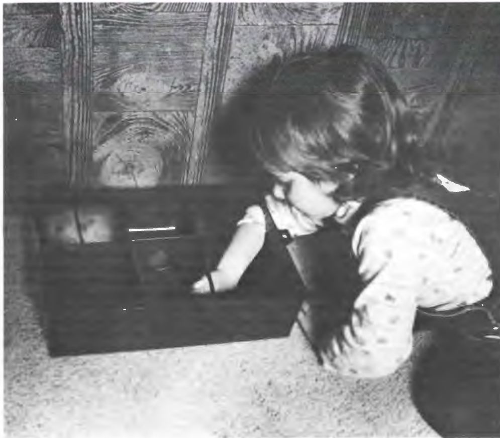
A child tries unsuccessfully to reach the rear compartment of a bait box, where poisonous bait would be placed to attract rodents. The box, whose lid has been removed for illustration purposes, shows one way to design a device that protects children from pesticide-treated bait.

designs. Laboratory tests conducted by EPA showed substantial differences among the samples submitted. Some designs impeded eating of bait by the rodents. Some units were more resistant than others to entry by ground-feeding birds. Some were more easily damaged than others by raccoons, the weather, even by target rats and mice. When EPA evaluated some of the stations for accessibility of bait to people, it again found wide differences among the units tested.