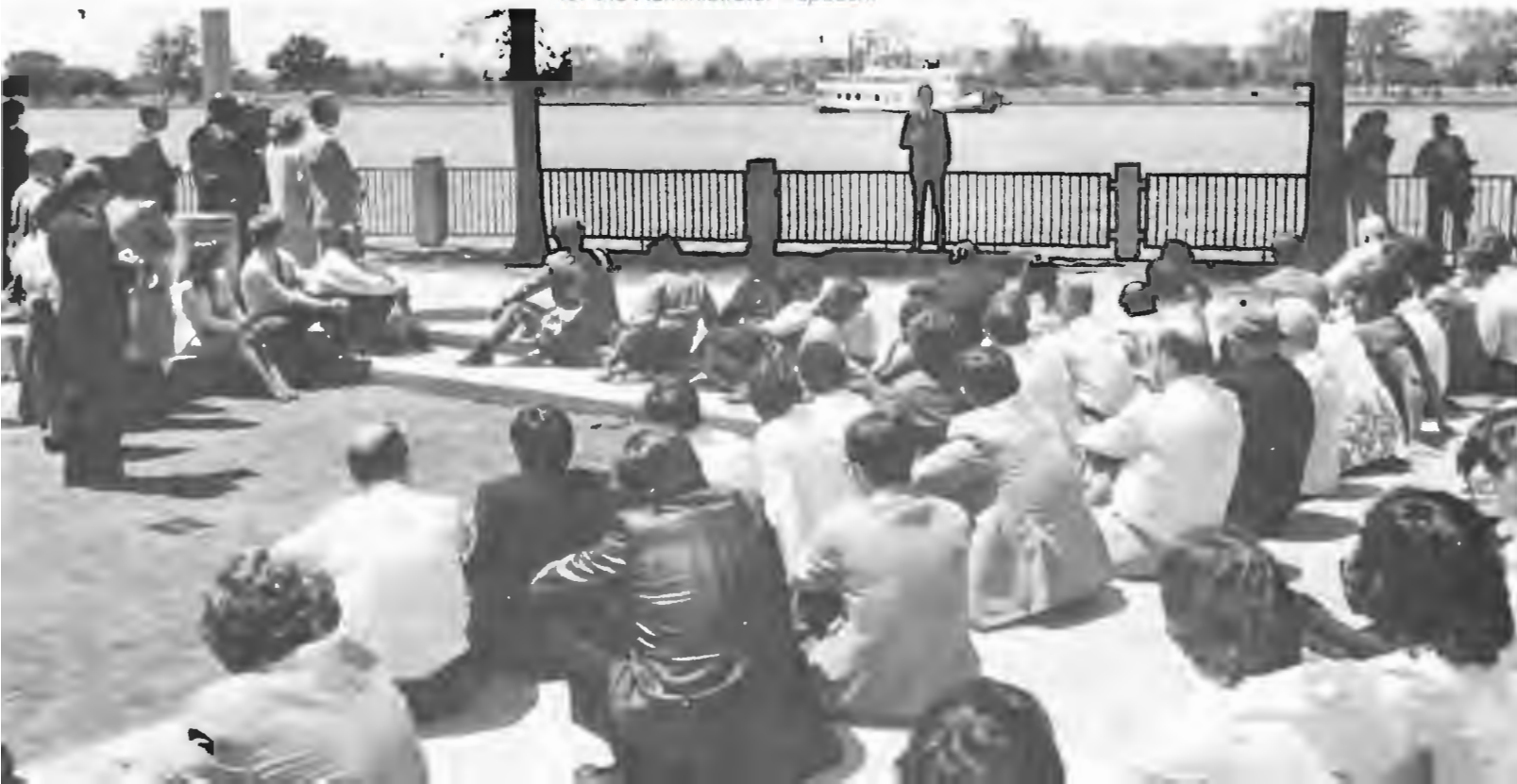
EPA employees turn the steps of the Waterfront Plaza into a mini-air theater for the Administrator's speech.