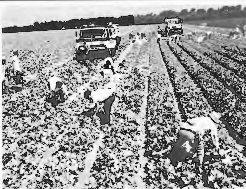
Field workers harvest and pick head lettuce for market near Salinas, California.

some of these were eaten and at least 30 persons, many of them children, were afflicted with severe and irreversible diabetes and damage to their nervous systems.