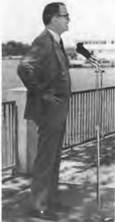
EPA Administrator William D. Ruckelshaus stands by the Washington Channel of the Potomac River and talks to outdoor gathering of agency employees.

One year after his official swearing-in on May 18, 1983, EPA Administrator William D. Ruckelshaus spoke to hundreds of EPA employees gathered on a windy but sunny day at the Washington Channel Waterfront Plaza for an informal picnic. Ruckelshaus began by alluding to "the cloudy skies" - both figurative and literal - that plagued EPA when he arrived a year ago and that kept his welcoming rally at that time confined to the indoor shopping mall in EPA headquarters. He credited EPA's career