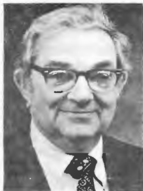
George Brown, Jr. Congressman (D-Calif.) Chairman, Subcommittee on Department Operations, Research and Foreign Agriculture House Agriculture Committee

What future do you see for pesticides? EPA Journal asked 13 leaders familiar with these chemicals their answer to this question. Those commenting included pesticide users, environmentalists and representatives of manufacturers. Their comments follow: