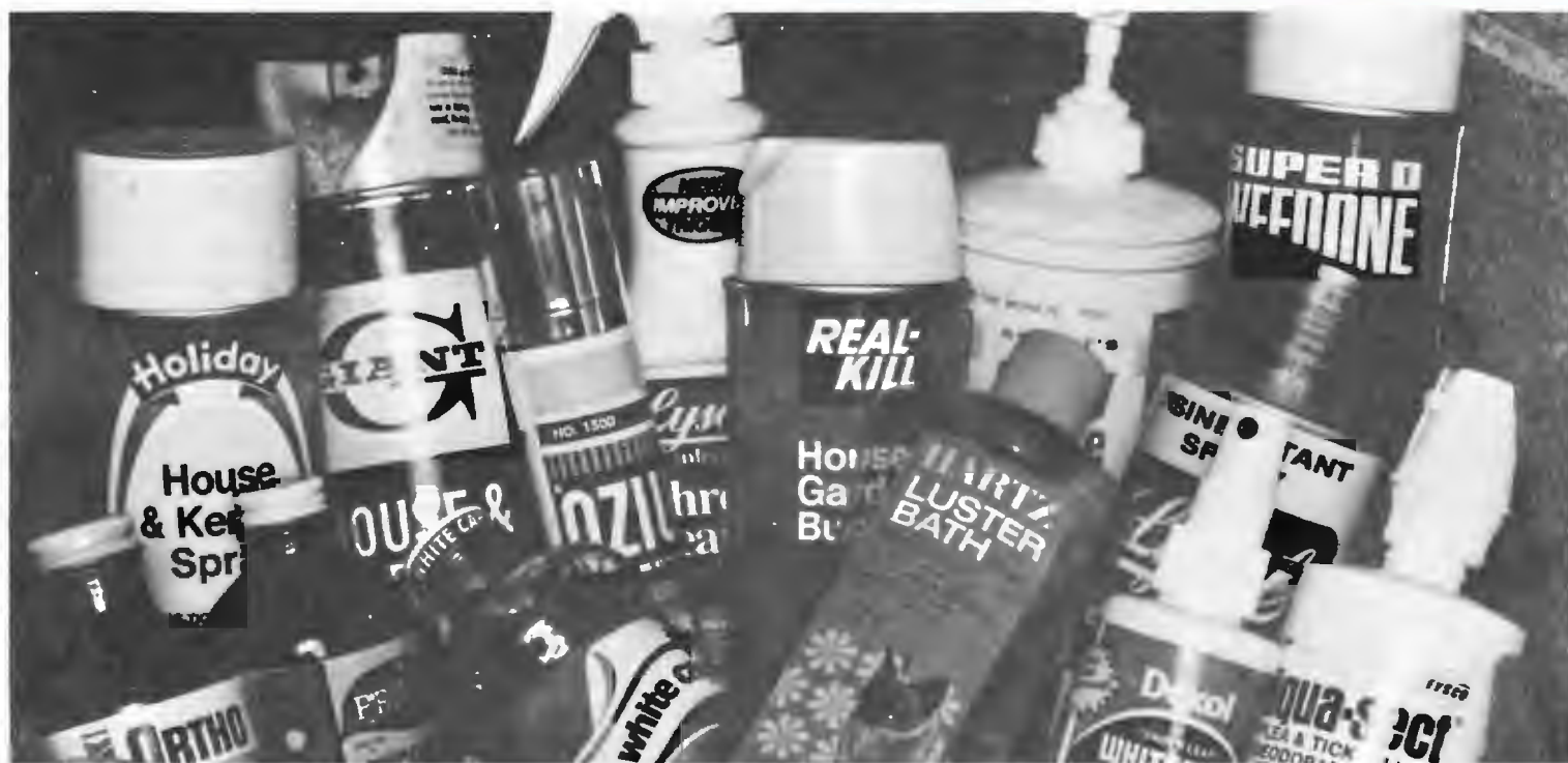
A household collection of bug killers, disinfectants, air sanitizers, and pest control products shows the variety of items subject to EPA pesticide registration process.

EPA's Office of Pesticide Programs has two major functions: registration of pesticides, by which EPA licenses the manufacture and sale of new pesticide products on the basis of safety testing data; and reregistration , which is a re-examination of old pesticides to be sure they meet the most current standards of safety testing. These two functions are part of EPA's mandated responsibilities under the Federal Insecticide, Fungicide, and Rodenticide Act (FIFRA) and the Federal Food, Drug, and Cosmetic Act (FFDCA). The agency administers the pesticide provisions of the Federal Food, Drug and Cosmetic Act jointly with the Food and Drug Administration.