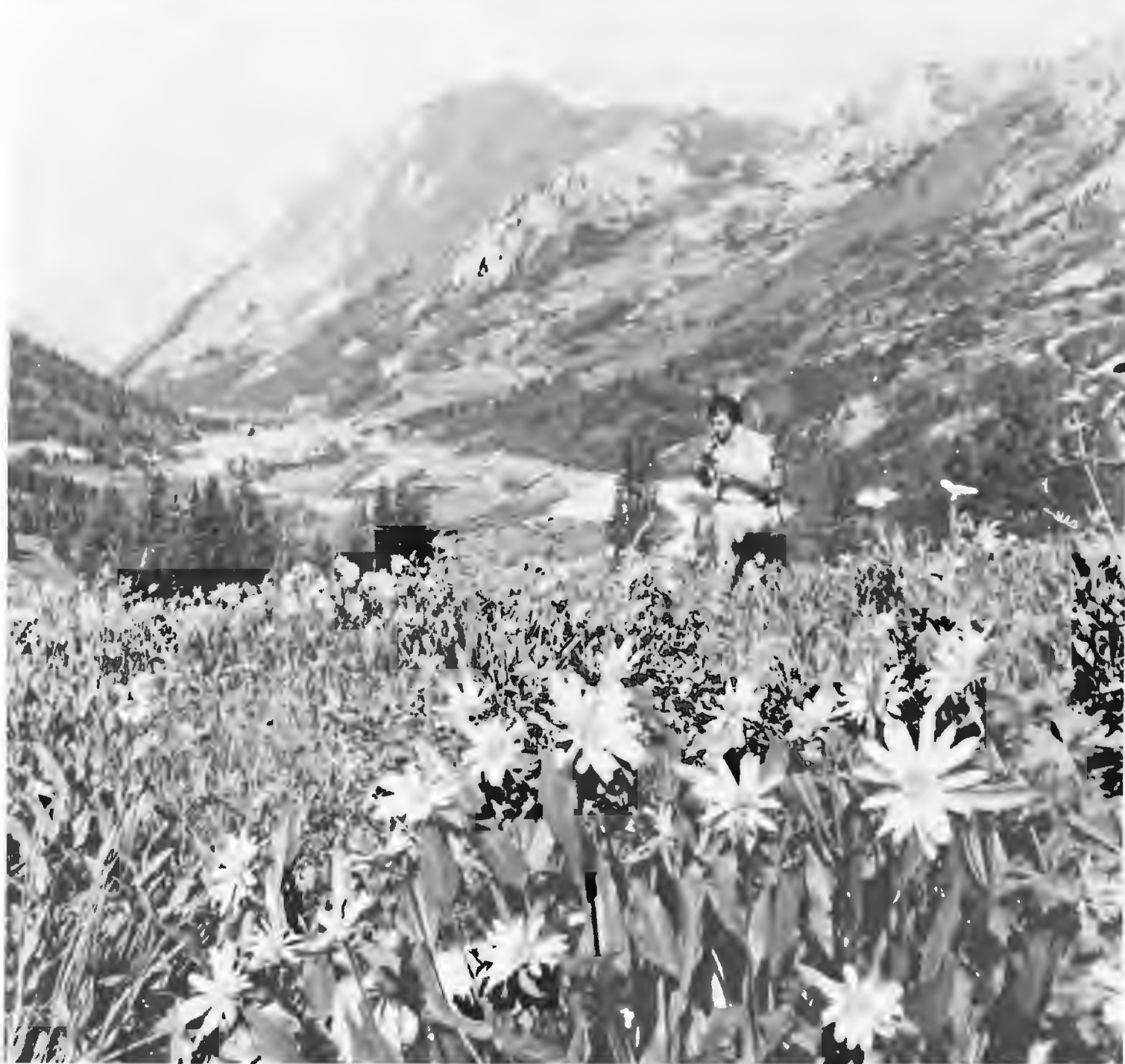
Clean air and flowers in northern Utah's Wasatch Mountains. EPA joined the American Lung Association, the State and Territorial Air Pollution Association, and the Association of Local Air Pollution Control Officials in sponsoring National Clean Air Week in May.

Back cover: A U.S. Department of Agriculture photo of a field of young corn growing in rural Cass County, Nebraska.