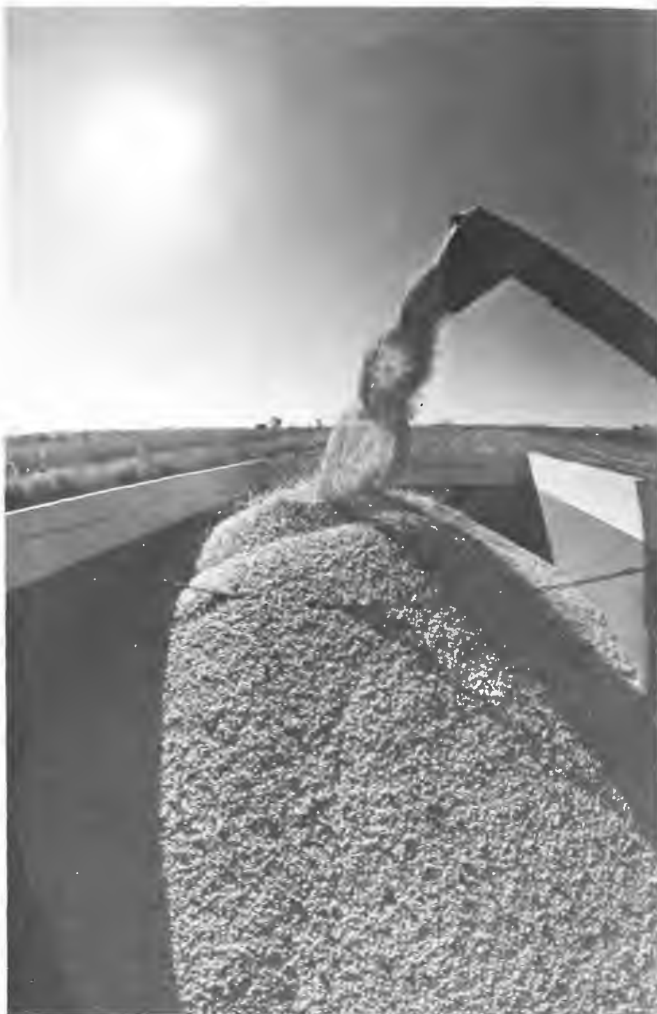
Freshly harvested Iowa corn fills a waiting wagon. Most American farmers rely on pesticides to increase production

In other features, new agency developments are summarized in Update, appointments and awards at EPA are announced, and Environmental Almanac notes a change in the environment at Antietam, the Civil War battlefield. □