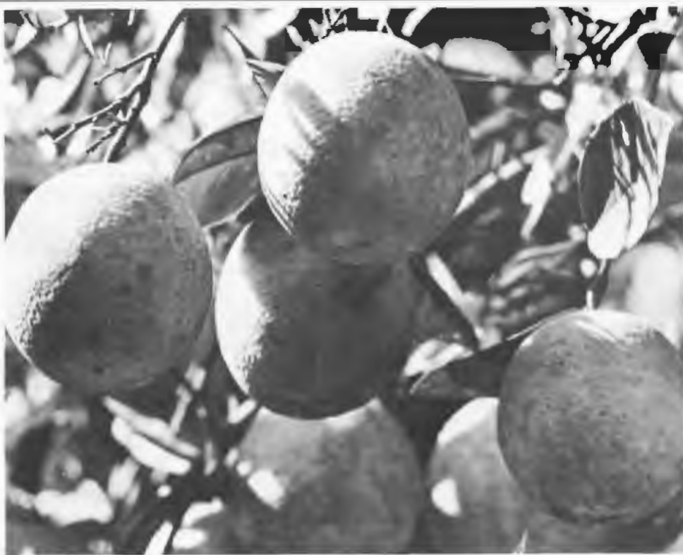
Oranges in a Florida orchard

proper handling and hygiene. Some 100,000 brochures have been distributed so far, and dozens of radio and TV stations carry the public-service announcements.