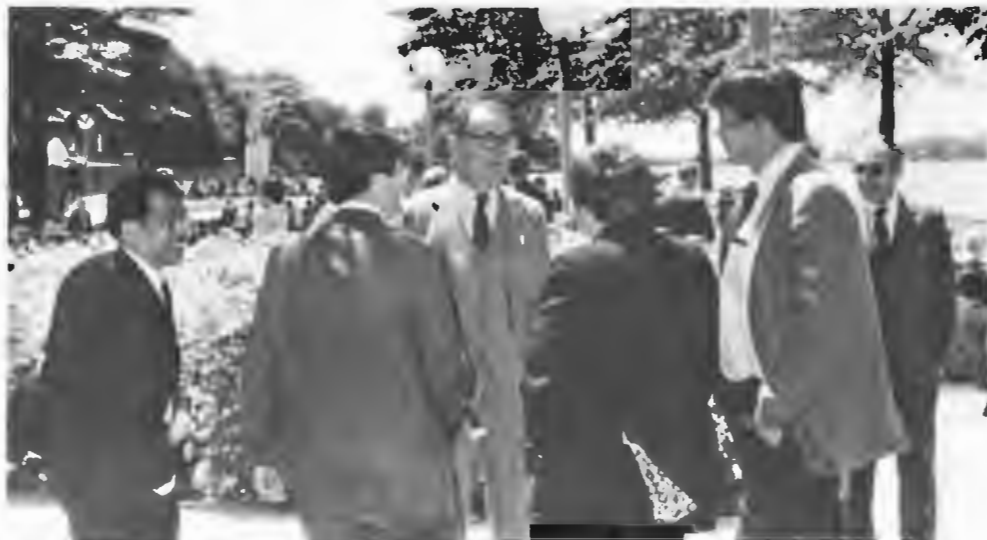
Ruckelshaus walks through crowd to shake hands and chat with EPA employees

employees with enabling him and his new management team to turn the image of the Agency around during the past year. "You are the finest group of public servants I've ever come in contact with," the Administrator said. Without this high degree of dedication from employees, the Administrator said he would have fallen short of his goal: "the restoration of trust in EPA....If people in this country don't believe that what is being done at EPA is being done competently and honestly then trust is destroyed." □