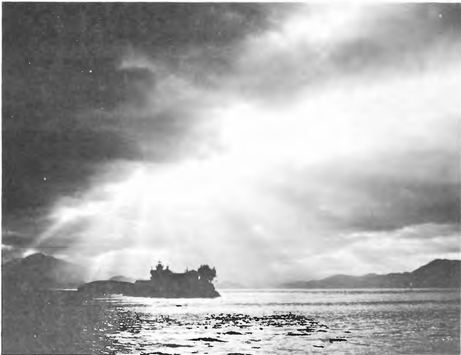
The sun bursts through dark clouds over Richmond Harbor, California.

environment. To any present day audience this side of Taiwan that speech would be preaching to the choir. This change in attitude is in one sense a tribute to the work of the Environmental Protection Agency since that time. We demonstrated that the ideals of Earth Day, which many in 1971 considered a vaporous fad, could be made to work, could be forged into effective instruments of national policy.