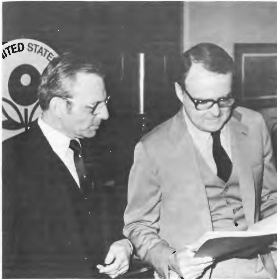
Frank Carlucci (left), chairman of a National Academy of Public Administration panel that reviewed EPA management problems, presents Administrator William D. Ruckelshaus with a report by the same panel. Carlucci, a former Deputy Secretary of Defense, is the Sears World Trade chairman.

some kind of a path to the future, pinpoint the things they think that should be emphasized in the agency in the next decade. In particular, they were to assess the morale of the employees, learn how the institution sees itself and consider how to improve that image. It was a very broad charter.