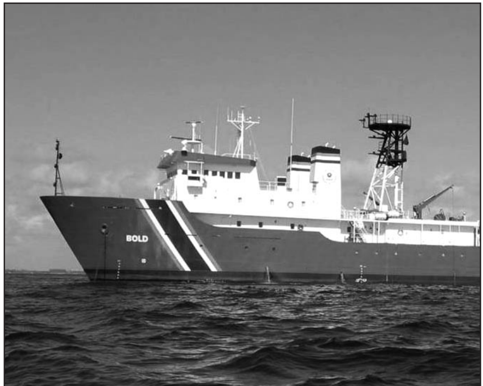
EPA's state-of-the-art Ocean and Coastal Research Vessel