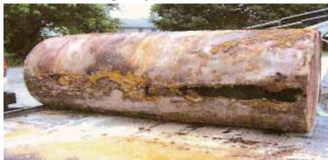
Excavated Leaking Underground Storage Tank

The largest penalty ever issued by an EPA administrative law judge for violations of any federal environmental law was against Euclid of Virginia, Inc. for UST violations at 23 gas stations in the District of Columbia, Maryland, and Virginia. Subsequently, in March 2008, EPA's Administrative Appeals Board increased the penalty to $3,164,555.