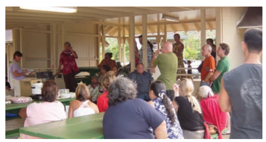
Kauai community meeting to receive input on the State's of Hawaii's Environmental Justice Initiative.

Many hair and nail salons in California use chemicals that may endanger the health of thousands of workers, their children, and customers. Salon workers often report respiratory problems and headaches, and their risk of cancer,