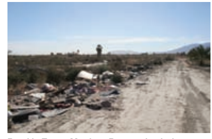
Road in Torres Martinez Reservation before cleanup.

THE RESOURCES: The collaborative funded these successes by leveraging $2 million from the California Integrated Solid Waste Management Board (www.ciwmb.ca.gov/grants or (916) 341-6000). The collaborative has also initiated targeted brownfields assessments (page 23) to facilitate productive reuse of former dump sites.