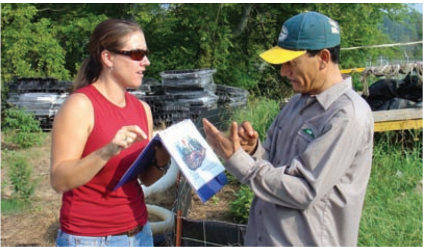
A pesticide inspector interviews a Spanish-speaking farmworker.

tion with 24-hour access to water from 26% to over 60%. With the implementation of the new requirements beginning in 2009, even more significant improvements are expected to move the island closer to achieving a safe, reliable drinking water supply for all residents.