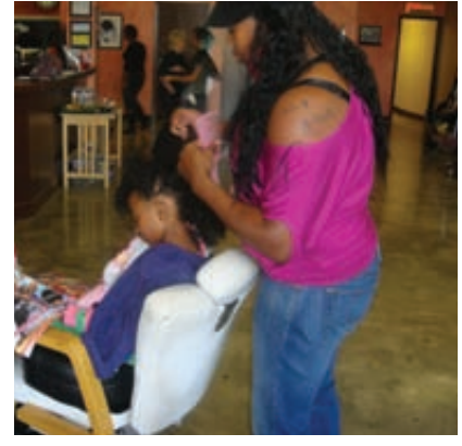
Reducing exposure to toxic chemicals at hair salons.

The information from the research and roundtables will be used to develop a "Healthy Hair Care Guide" to identify and promote safer and healthier hair styles and techniques. It will serve as