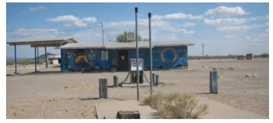
Lower left and above: Cleaning up petroleum contamination at a former Underground Storage Tank site, in Tuba City, Arizona.

In the CNMI, CUC and the Commonwealth's Water Task Force are implementing improvements to Saipan's drinking water and wastewater systems. Actions since 2006 on Saipan have increased the proportion of the popula-