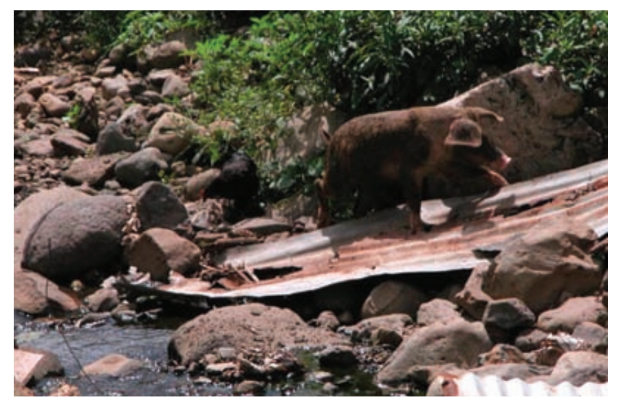
Outbreaks of leptospirosis are usually caused by exposure to water contaminated with the waste of infected animals, such as pigs.

THE RESULTS: "Team Lepto" has significantly reduced the pig waste discharged