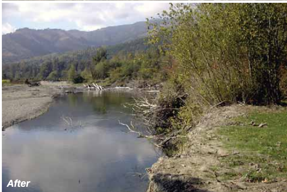
The collaborative efforts of the Nooksack Tribe, EPA, and the Bureau of Indian Affairs have reduced the immediate threats to water quality by removing waste from the river's edge and temporarily stabilizing the bank.