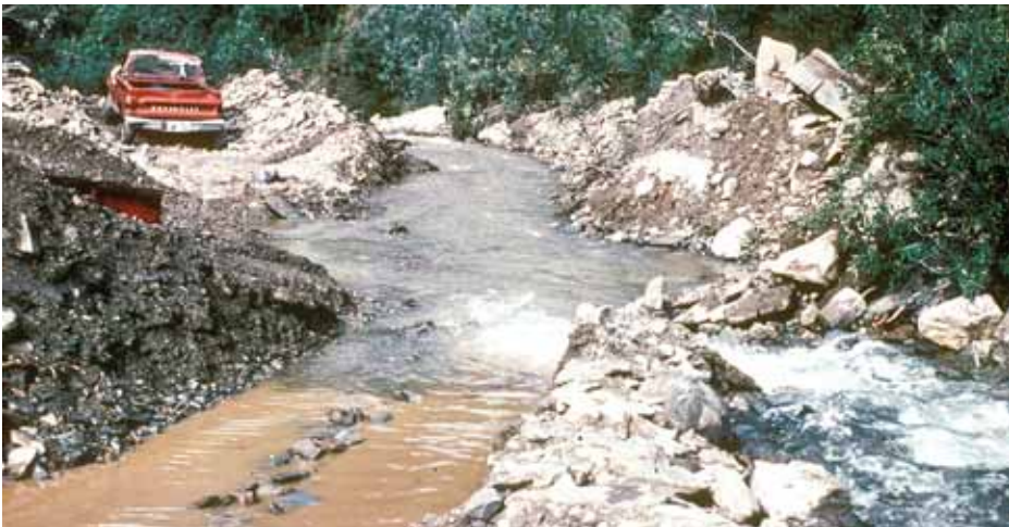
Placer mining poses potential water quality risks in the Pacific northwest and Alaska. EPA intends to minimize and contain those risks.