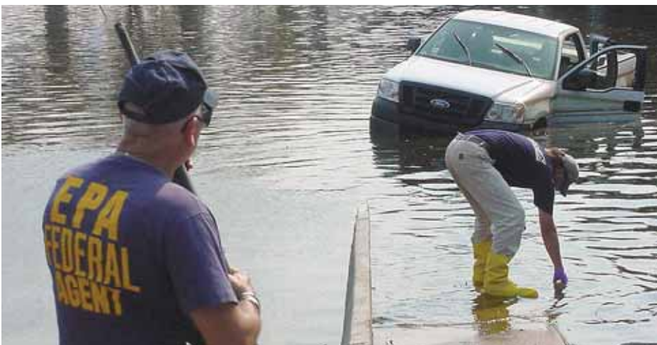
EPA staff taking water samples in flood damaged New Orleans after Hurricane Katrina. Region 10 provided approximately 89 people to help with homeland security, water sampling, and cleanup after the disaster.