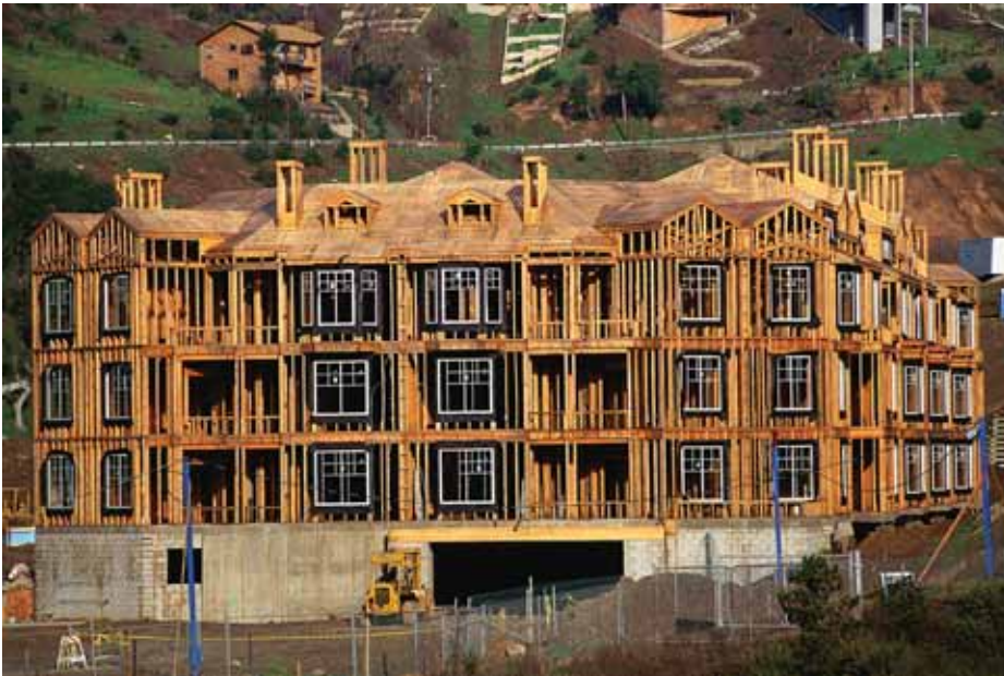
Continued growth is a reality in the Pacific Northwest and will likely be so in the future. EPA Region 10 hopes to partner with other government and commercial entities to work for sustainable future options we can all live with.