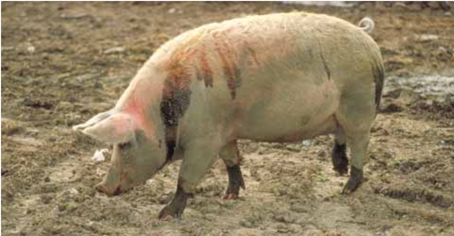
Animal feeding operations near water bodies have long been and will continue to be an area demanding EPA attention.