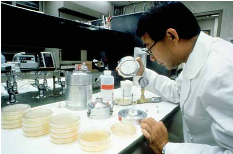
EPA needs engineers and scientists to carry out an increasingly demanding and complex mission.