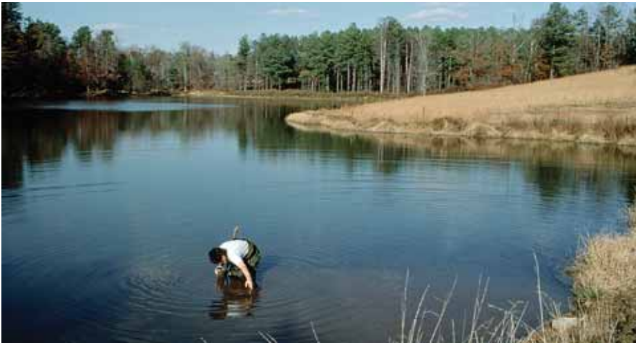
Continued monitoring of Region 10 watersheds is a necessary part of our strategy for clean water now and in the future.