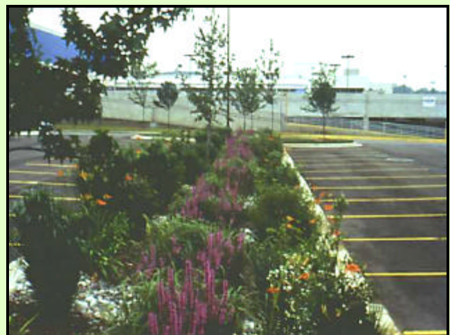
Figure 1. Bioretention landscaping at the Inglewood demonstration project site.

A landscaped island measuring approximately 38 feet by 12 feet was chosen as the retrofit area. The island contains a curb inlet that drains into the municipal storm drain system. Almost the entire drainage area is impervious. A 4-foot slot was cut into the curb immediately before the inlet. The landscaped island was then excavated to a depth of 4 feet. An underdrain was installed and tied into the bottom of the existing inlet to completely drain the planting soil to avoid oversaturation. The underdrain was covered with 8 inches of 1- to 2-inch gravel and backfilled with typical bioretention soil mix. The backfill extended to a depth of about 12 inches below the top of the curb, which allows for a ponding depth of approximately 6 inches of water in the island