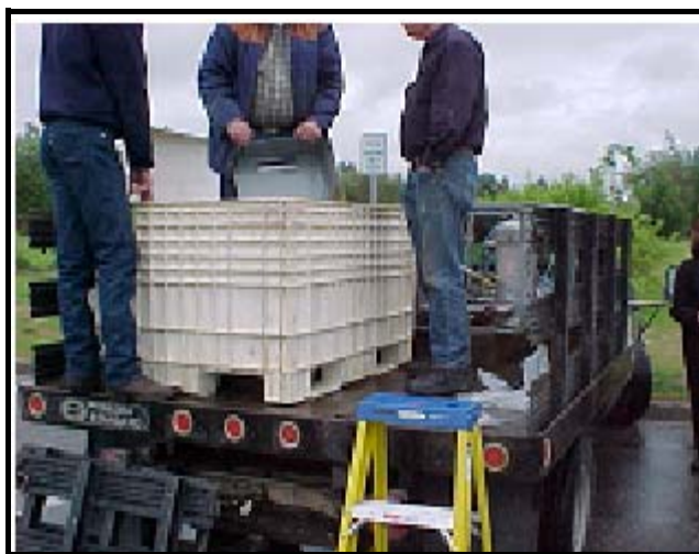
Figure 3: Truck mounted CampWater™ Porta-5

Since there are no chemicals to purchase, filter replacement is the predominant maintenance cost. The particulate filters cost $70.00 (12 each) and if used by the system, the carbon filters cost $48.00 (4 each). While the frequency of replacement will depend on the contaminant load, an 800 hour run