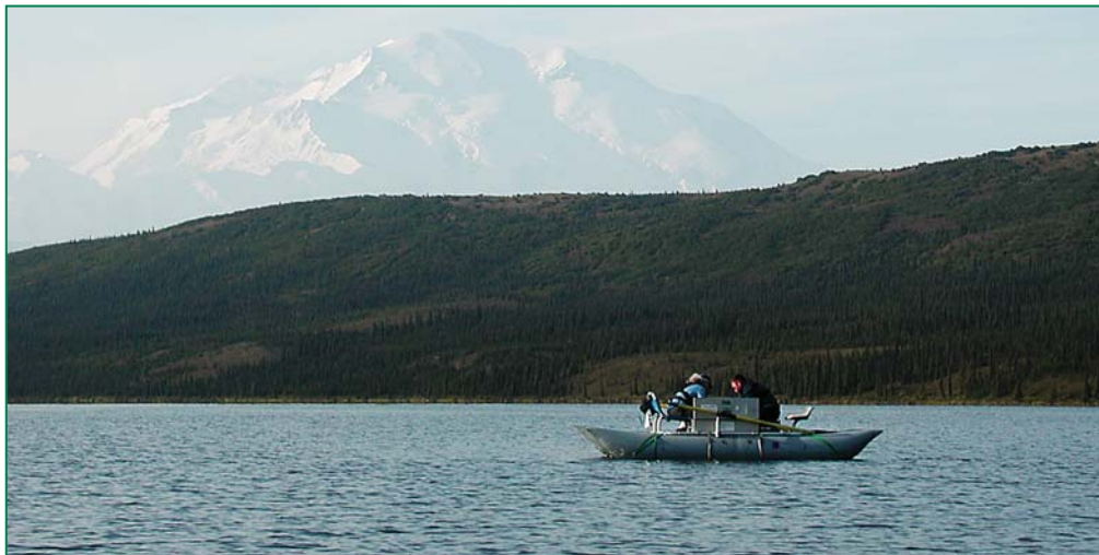
With North America's highest mountain, 20,320-foot Mount McKinley, in the background, researchers filter 50-liter water samples in Wonder Lake, Denali National Park.

The project is documenting the adverse effects of atmospheric transport of anthropogenic pollutants in some of the nation's most remote, and presumably pristine, places. Airborne contaminants can pose a serious health risk to wildlife and humans. Some toxins tend to "biomagnify," that is, small concentrations in air, water, snow, and plants can result in larger concentrations higher in the food web such as in fish and mammals.