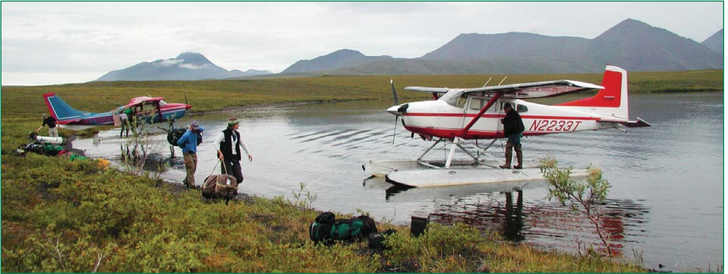
In northern Alaska, such as at Buriel Lake in Noatak National Preserve, WACAP researchers employed aircraft to reach study sites and to ferry out their samples.

How do these contaminants reach such pristine, protected places? An important component of WACAP is to examine the atmospheric transport of chemicals. Already substantive information about the movement of contaminants has been compiled. Evidence from multiple sources indicates that both current-use and banned chemicals are present in national parks.