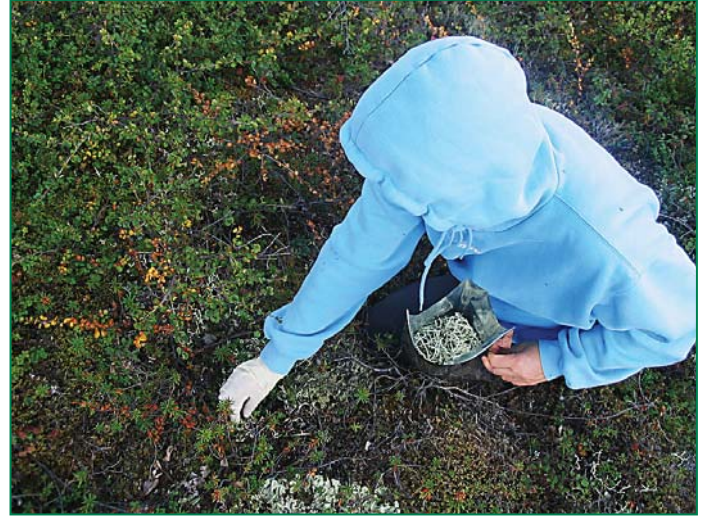
Collecting lichen samples from Alaskan tundra.

samples are currently available. These reveal spatial patterns in mercury concentration. In the Alaskan samples, the concentrations tend to be quite variable, a likely effect of the shallow depth of snowpacks at low-elevation inland sites and relatively large amounts of wind-blown crustal material in the snowpack. Along the west coast of the