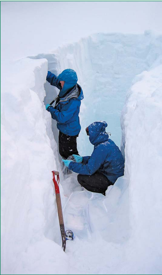
Protocol for snow sampling requires a great deal of shoveling.

WACAP is analyzing how atmospheric contaminants reach the national parks. A primary goal of the atmospheric transport component of the study is to illustrate movement of air masses from all source regions that may be affecting the western national parks. Air masses from agricultural regions in California, Mexico, and Canada could explain contaminants in some parks. However, because there is strong and persistent west-east flow of air masses at the latitude of all the parks, significant amounts may be coming from distant western sources in Asia and Europe.