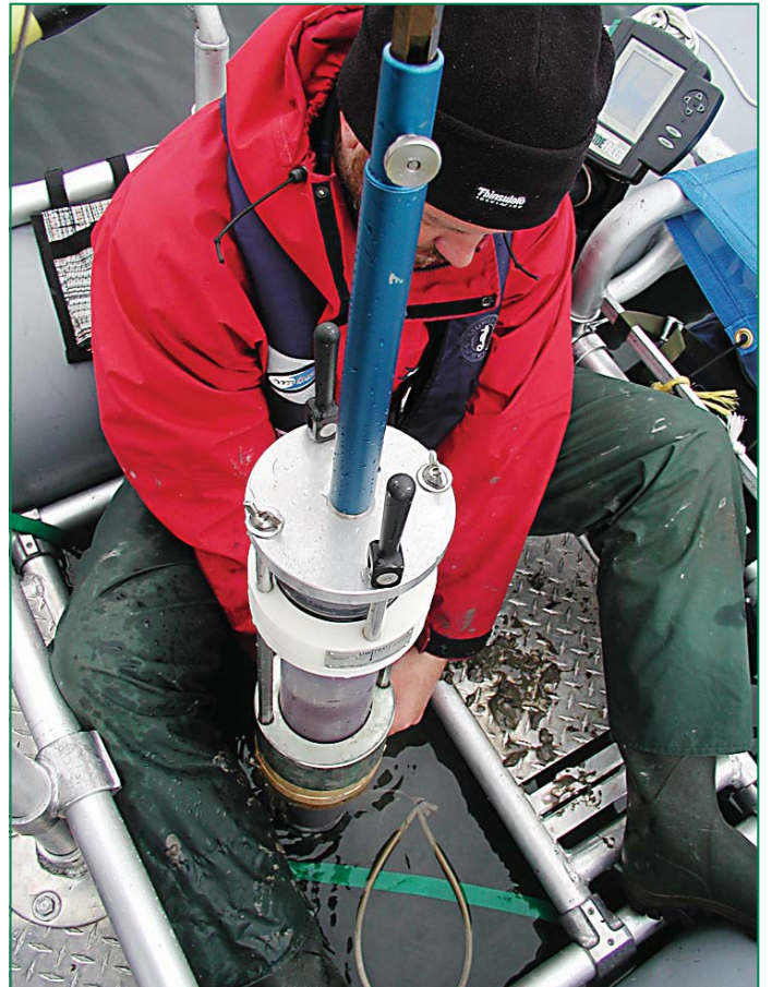
A WACAP researcher operates the lake sediment sampler.

contiguous 48 states, most of the parks had a fairly low concentration of mercury, while inland sites, Glacier and Rocky Mountain National Parks, had a higher concentration, presumably related to higher concentrations of particulate matter there. Additional data are being posted as they become available.