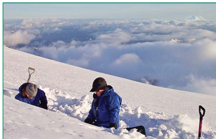
A WACAP team samples snow on Mount Rainier in Washington.

WACAP scientists are measuring a broad suite of persistent organic pollutants such as PCBs, DDT, DDE, HCHs, and HCB. Although many of the contaminants have been banned in the United States, they are still used in other parts of the world. Chemicals in current use that are being assessed include pesticides and flame retardants. Mercury is of special interest and is being analyzed in all samples except water.