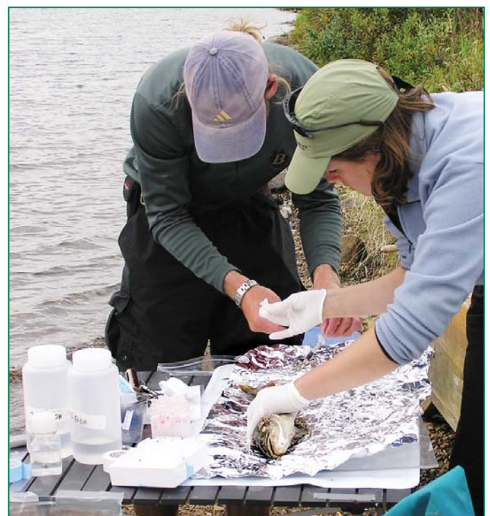
Working beside a lake in an Alaskan wilderness park, researchers dissect a fish to evaluate condition and possible impacts of contaminants.