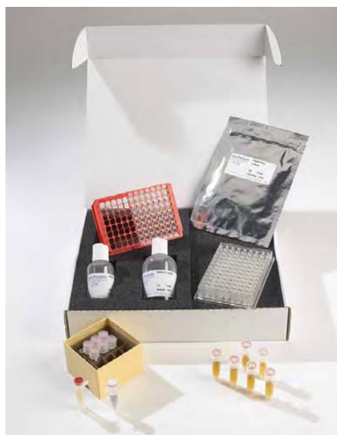
Figure 3. Procept® Rapid Dioxin Assay Kit