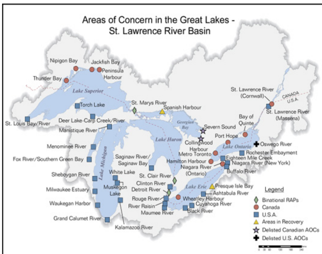
Figure 1.1: Geographic location of U.S. and Canadian AOCs

State or local sponsor commits 35 percent or more of the clean-up cost, the remaining amount (up to 65 percent) is provided in federal funds. The Legacy Act was reauthorized in 2008, extending funding through Fiscal Year (FY) 2010.