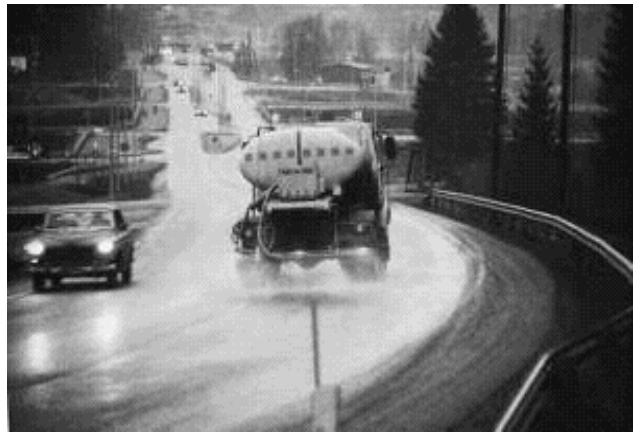
Anti-icing chemical application.

Alternative deicing chemicals include calcium chloride and calcium magnesium acetate (CMA). Another alternative, sodium ferrocyanate, should be avoided due to its toxicity to fish. Although alternatives are usually more expensive than salt, their use may be warranted in some circumstances, such as near habitats of endangered or threatened species or in areas with elevated levels of sodium in the drinking water. Sensitive areas and ecosystems along highways should be mapped, and the use of deicing alternatives should be targeted to those spots. Other considerations for using alternatives to salt include traffic volume and extreme weather conditions.