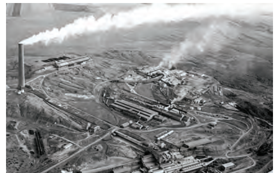
Historical aerial photograph of the ACM Smelter and Refinery.