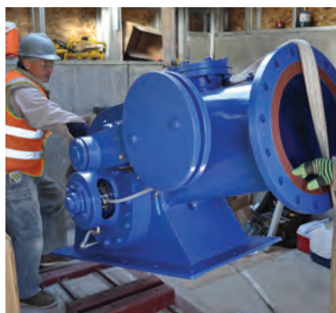
Installing hydroelectric equipment at the Summitville Mine site in Colorado.

By incorporating the use of RENEWABLE ENERGY RESOURCES , EPA and its partners are maintaining the effectiveness of remediation methods while reducing greenhouse gas emissions from conventional power sources.