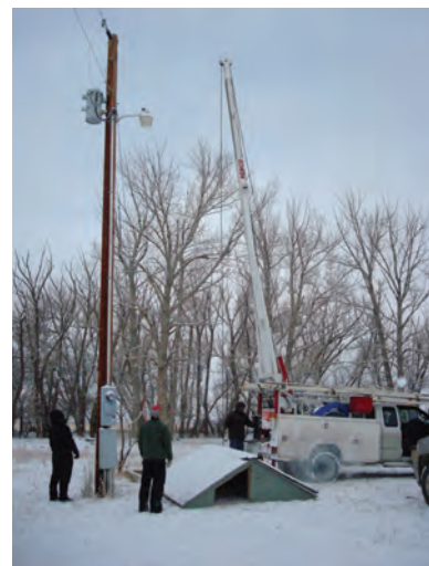
Superfund sampling team preparing a domestic well in Pavillion for sampling.

President Carter signs Superfund law, creating the federal government's program to clean up the nation's uncontrolled hazardous waste sites and making polluters liable for toxic cleanups.