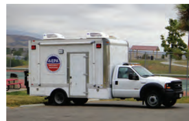
Region 8 emergency response vehicle at the Operation Neptune exercise, 2010.

In 2010, Region 8 also continued to provide support and training for the Response Support Corps (RSC) program. The program is staffed by volunteers from all programs who are willing to respond to major regional and national emergencies. Region 8 currently has 102 fully trained RSC members and 154 total volunteers.