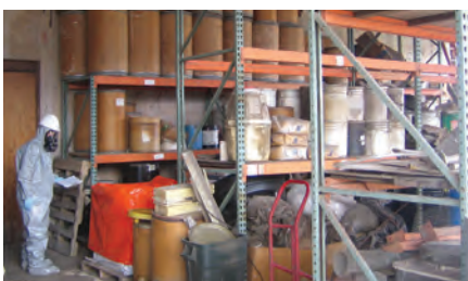
Initial assessment of leaking and improperly stored chemicals.

Region 8’s Emergency Response Unit provided assistance to several tribes during 2010, including cleanup of vandalized buildings containing friable asbestos that endangered nearby residents; cleanup of abandoned drums; investigation and sampling at a school where flash flooding caused a release of stored chemicals and oil; and investigation and sampling of downstream impacts where spring flooding caused a wastewater treatment plant to overflow.