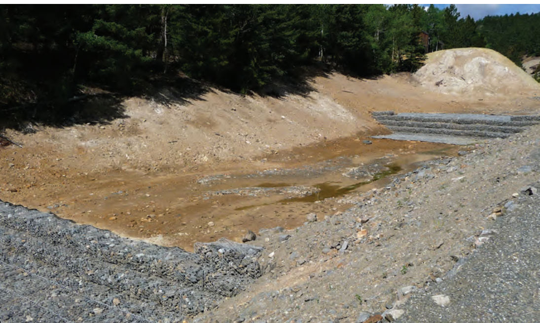
Sediment control and restoration work along the North Fork of Clear Creek in Colorado.

million tons of contaminated sediment have been removed and the restoration of the Clark Fork River's channel and floodplain will be completed by 2012. And in 2010, 450 acres at the site were transferred to the State of Montana for a new state park. Interim redevelopment activities, including several trails and a new pedestrian bridge, were completed. More than $3 million in grant funding has been allocated for the park's development, on top of about $5 million already allocated for land acquisitions and adjoining trails and the pedestrian bridge.