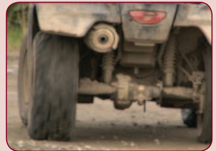
All terrain vehicles and four-wheelers stir up road dust.