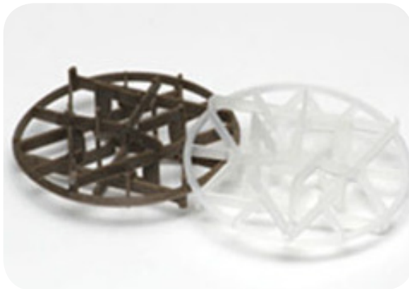
Sample plastic packing material.

Air stripping is an effective way of removing VOCs from contaminated water and is commonly used as part of groundwater pump and treat systems at sites around the country. Air strippers can be brought to the site eliminating the need to pump contaminated water for offsite treatment.