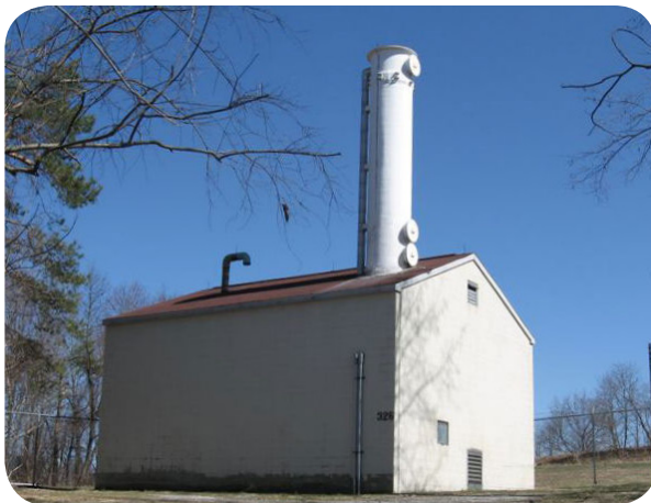
Air stripper and treatment building

Installation of the air stripper and treatment equipment may require use of heavy machinery, especially at large contaminated sites. Area neighborhoods may experience some increased truck traffic as the equipment is delivered. Large tanks or columns may be visible from the street and may need to operate for many years. However, care is taken to make sure the operation of air strippers is as quiet as possible.