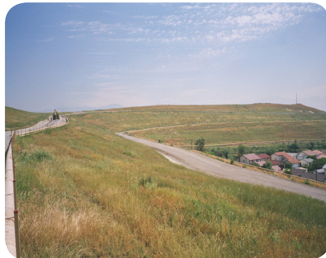
Example of ET cover used at Operating Industries, Inc. Landfill Superfund site.

Like other caps, ET covers do not destroy or remove contaminants. Instead, they isolate them and keep them in place to prevent the spread of contamination and protect people and wildlife from the contaminated material. ET covers are constructed by placing a 2- to 10-foot-thick layer of fine-grained soil containing silt and clay over the contaminated material. The type of soil is chosen for its ability to store water and promote plant growth. The thickness of the cover depends on how much rainfall and snowmelt is expected in the area. Grass, shrubs, or small trees that form extensive