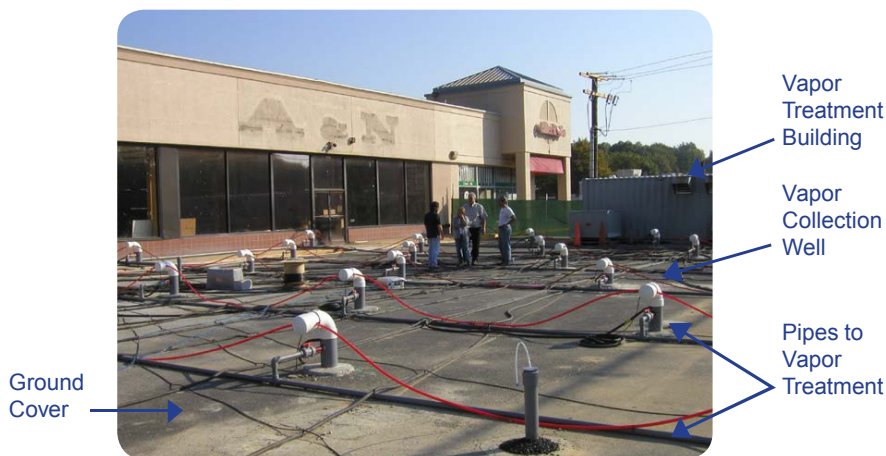
ERH system cleans up contaminated soil and groundwater.

In situ thermal treatment methods speed the cleanup of many types of chemicals, and are among the few in situ methods that can clean up NAPLs. Thermal treatment can be used in silty or clayey soil where other cleanup methods do not perform well. They also can reach contamination deep underground or beneath buildings, which would otherwise be difficult or costly to dig up to treat above ground. In situ thermal treatment has been selected or is being used in cleanups of at least 12 Superfund sites as well as dozens of other sites across the country.